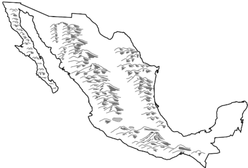
Topography of Mexico