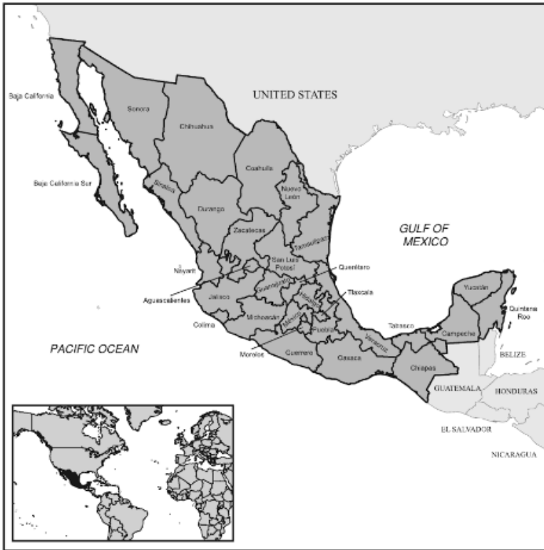
Current Political Map of Mexico; Source: Martínez (80)