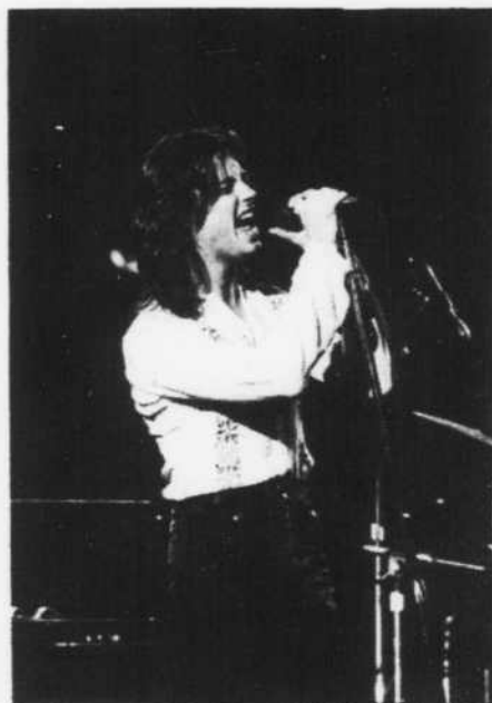
One of two brand-new members of the James Gang, the lead vocalist who replaced Joe Walsh, rocks with the microphone stand during a rendition of "Funk 49."

With only one original member, the James Gang, after a seemingly interminable break, came on