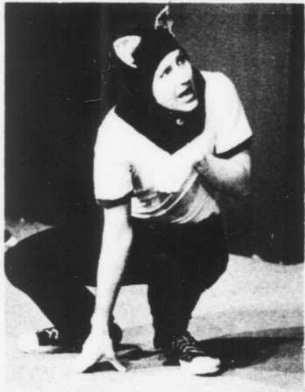
An old cat complains that his master wants to kill him in the "Bremen Town Musicians" segment of "Story Theatre."

"Story Theatre," in the midst of a seven day run in the arena theatre, is a simple show in terms of