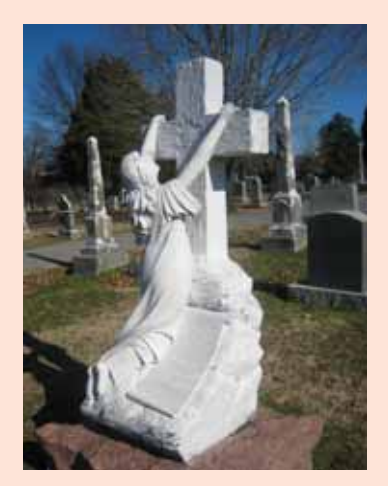
Headstone at Oakland Cemetery in Trenton, Gibson County

Smithson-McCall Farm, Williamson County Oakland Cemetery, Gibson County Pi Beta Phi Settlement School Multiple Property Submission, Sevier County Promise Land School, Dickson County Pi Beta Phi Dormitories and Dwellings District, Sevier County