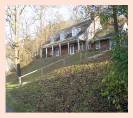
Pi Beta Phi dormitory in Gatlinburg, Sevier County