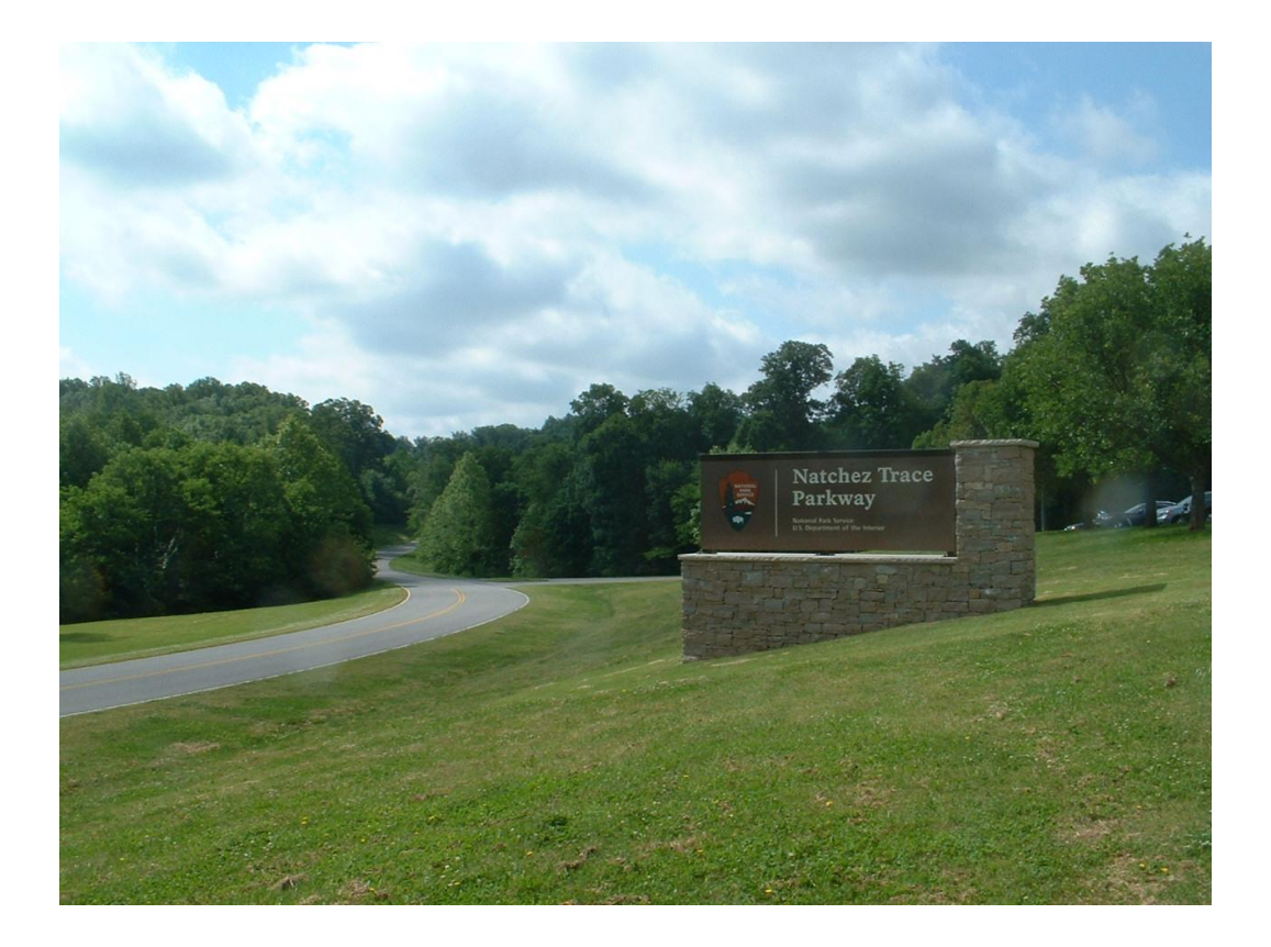
Figure 10. The northern terminus of the Natchez Trace Parkway, Nashville

The Trail of Tears National Historic Trail is another example of an historic route interpreted for visitors. The National Park Service created a network of roadway signs for the Trail of Tears, the forced removal of the Cherokee people from their homeland in Georgia, Alabama and Tennessee in 1838-1839. Signs, interpretive kiosks, visitor centers and online presence all help visitors find sites along the thoroughfare. The National Park Service has effectively branded the route a National Historic Trail to help visitors pursue the heritage of the Trail of Tears. Its website offers a process for