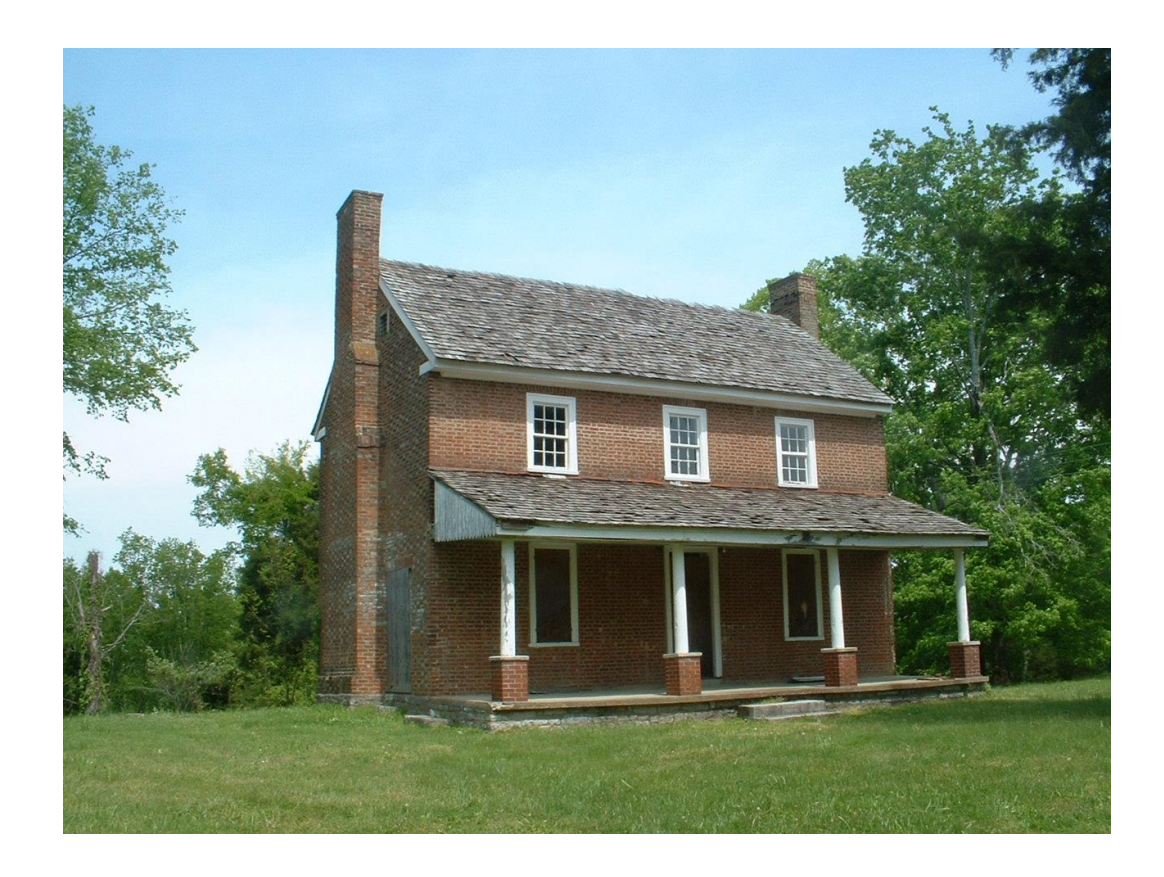
Figure 6. Hawthorne Hill

windows flanking wood paneled entry doors and three six-over-six double-hung windows on the second story. Both east and west elevations feature an exterior brick chimney. A shed roof porch dating to the 1950s detracts from the Federal simplicity of the house. The house is situated on 10.45 of the original 208 acres owned by Bearden.<sup>28</sup>