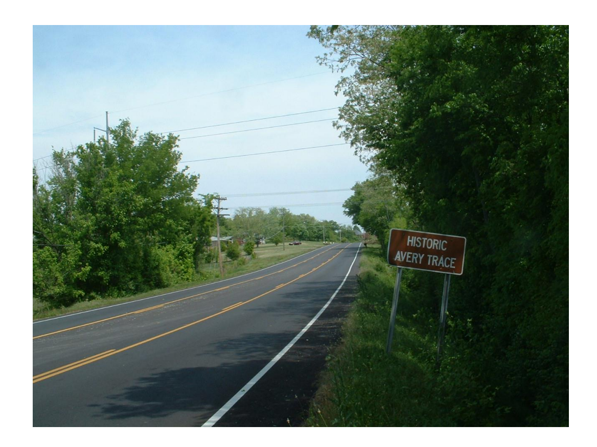
Figure 12. The Avery Trace commemorated on Hartsville Pike in Gallatin

There is no Avery Trace Parkway, nor even a Tennessee Historical Marker for the road itself. During the late 1980s, Sumner County's Avery Trace Association convinced the state to declare existing state highways as the Historic Avery Trace. On March 6, 1990, officials marked the route with brown signs from Nashville to Kingston.<sup>13</sup> This route may approach the actual path of the historic road, but probably only for short stretches at a time.