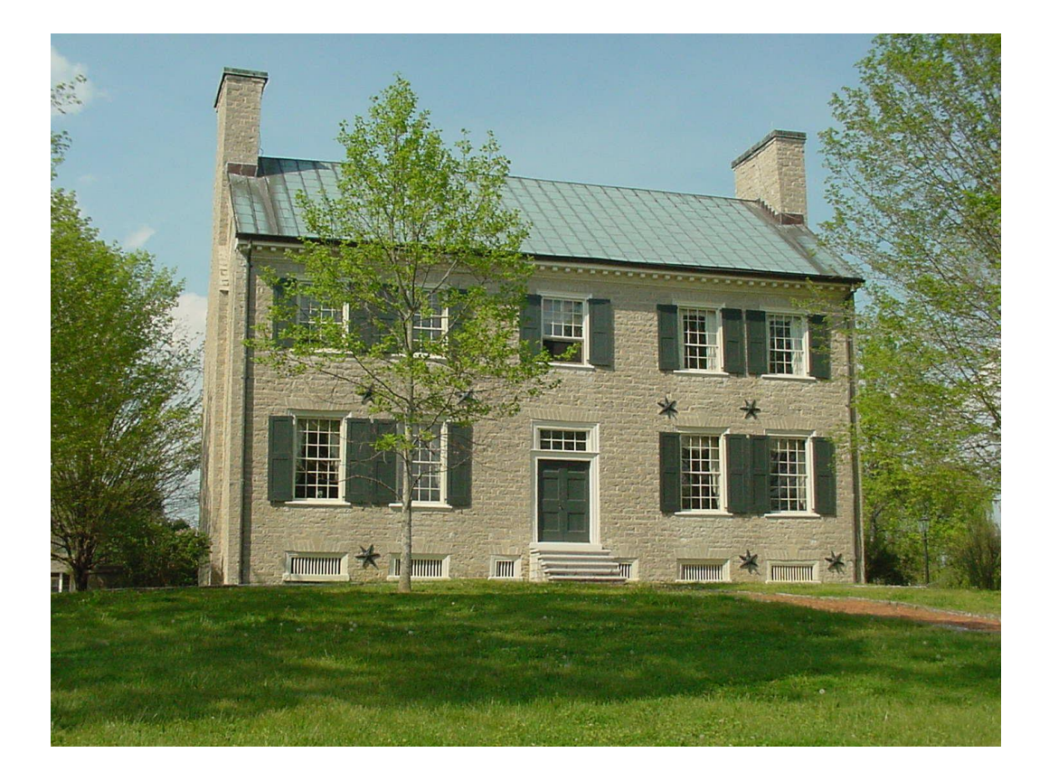
Figure 7. Cragfont, Castalian Springs

The excellent craftsmanship of Cragfont is evident everywhere in the home. The most distinctive architectural millwork is in the entrance hall and parlor. The floors are ash, the doors leading from the hall are set in deep reveals with molded architraves. Tongue and groove construction is of fine craft. The parlor is considered the finest room in the house. The parlor mantel is delicate, with a gently tapering column at each end. Centered in the windowless west wall is a large fireplace set with dark marble. Looking into the attic offers a view of the rafter system, featuring a system of king post trusses joining queen posts on both sides with a finely-crafted series of notches, fittings and