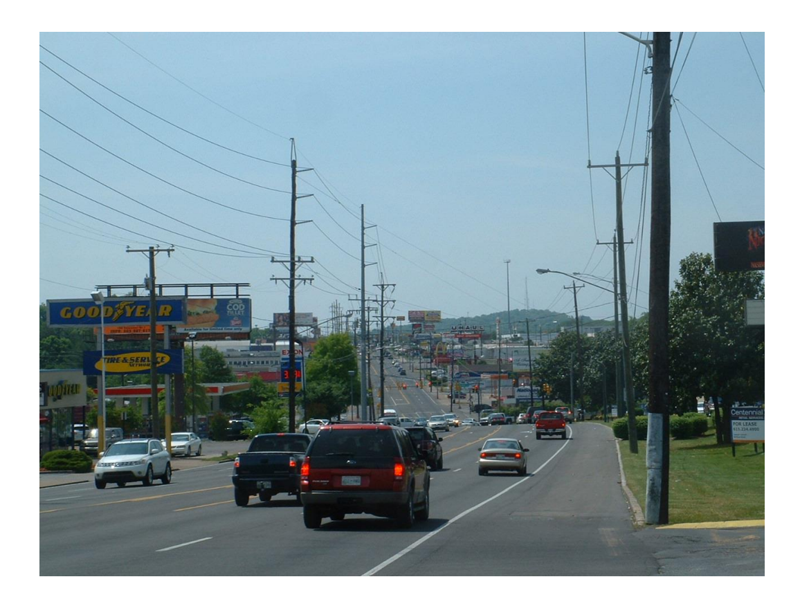
Figure 13. The modern Avery Trace, Gallatin Road, approaching Nashville in Madison