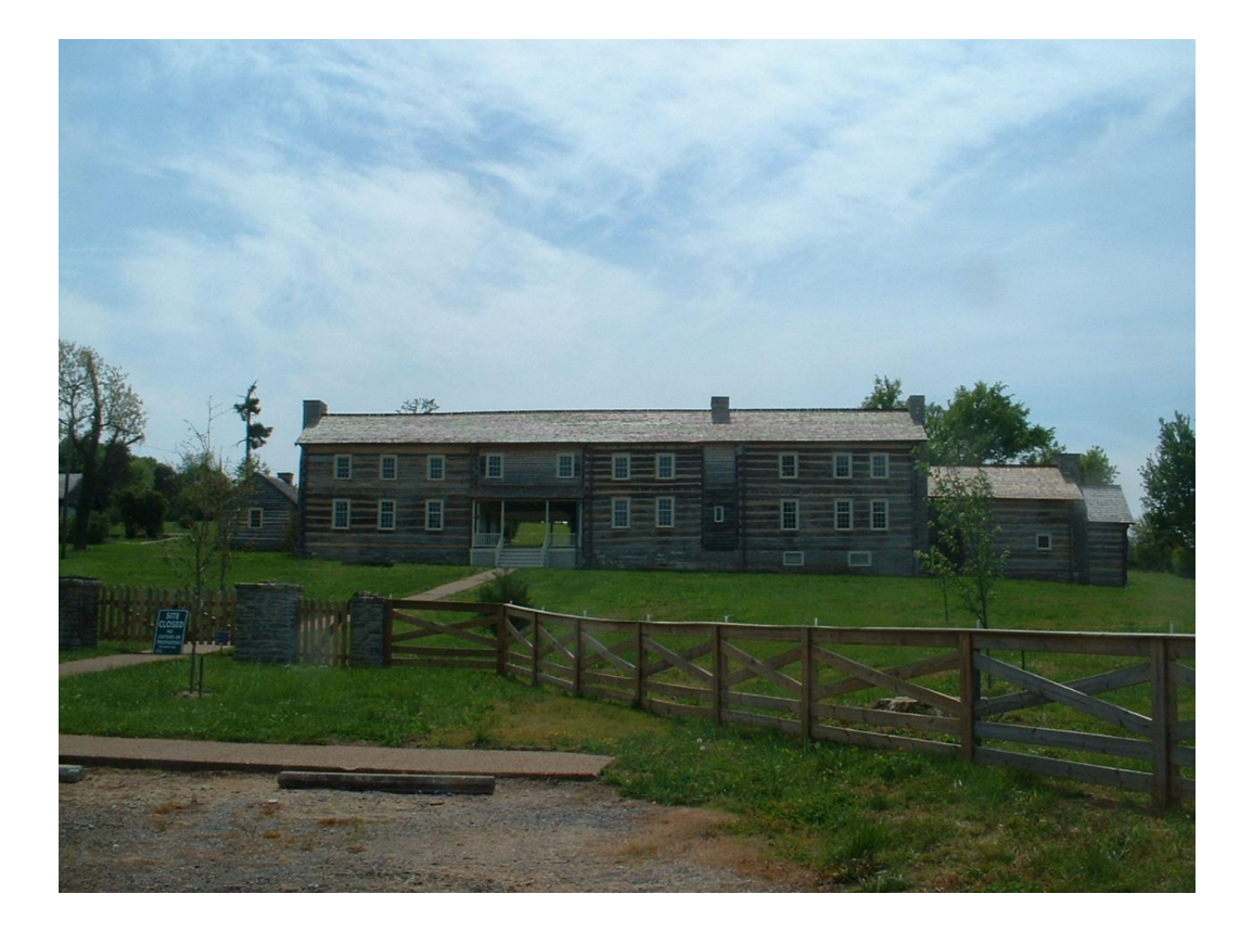
Figure 5. Newly-restored Wynnewood, 2012

until 1971, when the state acquired it for preservation as an historic site.<sup>27</sup> The house was damaged by tornadoes in 2008. The state has worked at its restoration work since that time, and Wynnewood will open to the public in the summer of 2012.