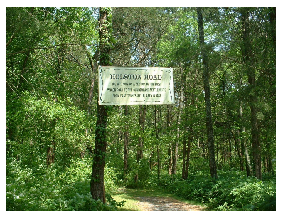
Figure 9. A portion of the Avery Trace marked at Bledsoe's Station

The original path of the Avery Trace is largely lost. It runs through farms, businesses, local roads, railroads, Tennessee highways 53, 85, 84, 24, 25, U.S. highways 31E and 70N, and U.S. Interstate Highway 40. The name and legacy remain in cities, small towns and forgotten corners of Middle Tennessee.<sup>1</sup> The opportunity may already have passed for Tennessee to memorialize the Avery Trace as it has the Natchez Trace but the name still carries importance to the early history of the state.