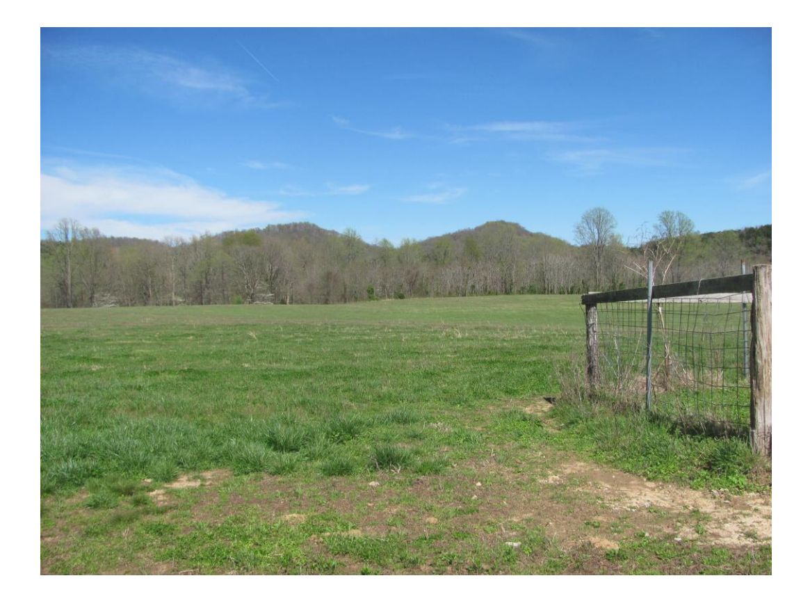
Figure 11. The site of Fort Blount in 2011

The report concludes that a potential historic interpretation based on Fort Blount would be an effective means of telling the story of frontier Tennessee, and a useful and effective stop for heritage tourism. It emphasizes the potential of interpreting the lives of Middle Tennessee settlers, the forces that drew them west, and the frontier conditions that shaped their lives once they arrived. The Fort Blount/Cumberland Frontier Museum project remains a project with potential.