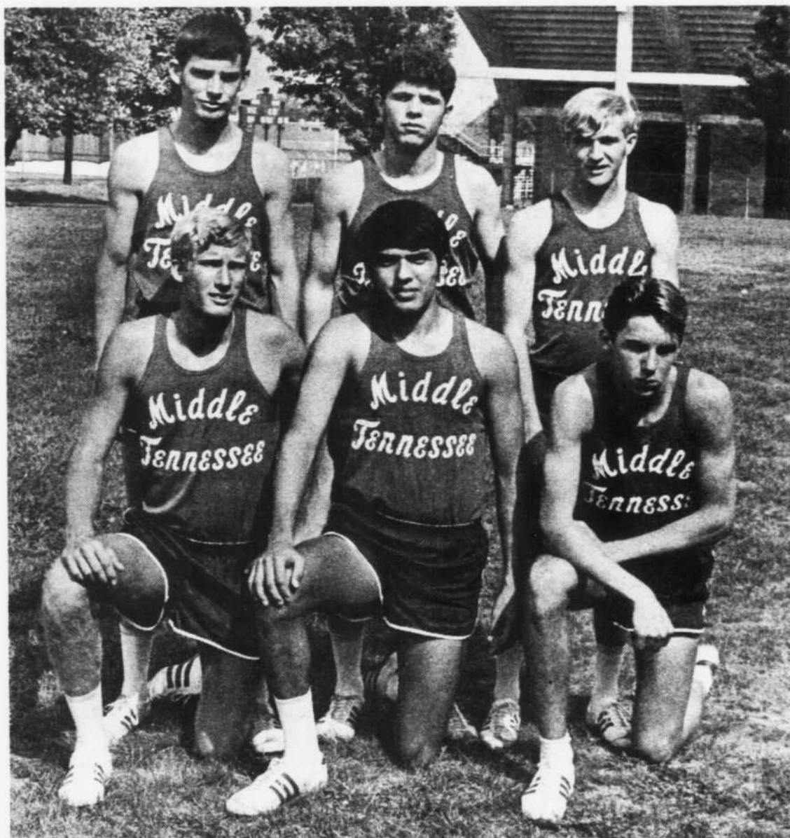
FIGHTING HARRIERS: These six runners make up this year's cross-country squad, which stands with a 1-2 record going into this Saturday's meet with defending Ohio Valley Conference

They key play came when the Indians recovered a Tech fumble