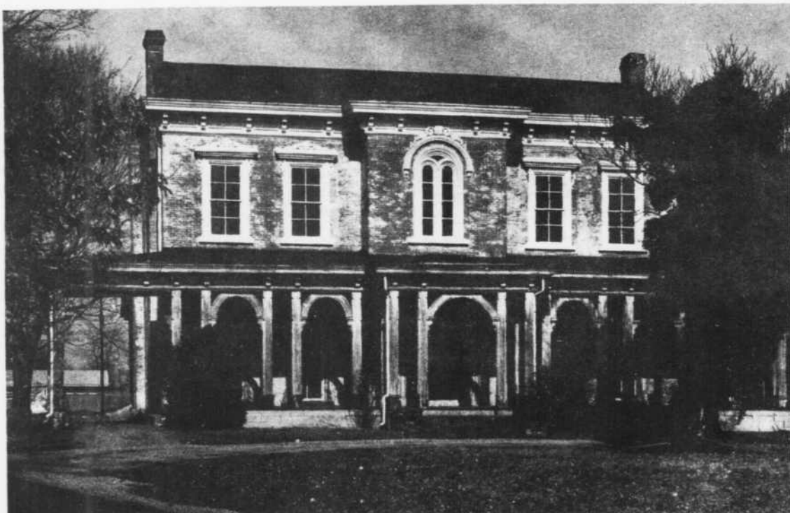
Oaklands Mansion, Murfreesboro's House of history, will host an Art show and sale on Oct. 10, 11 and 12. The show will feature works of MTSU art students.