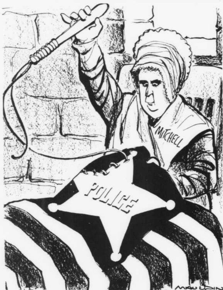
OUR NEW BETSY ROSS

So 15 years of legal precedent are giving way now to Mr. Nixon's "new federalism." "The Supreme Court," Mr. Dooley told us, "follows the illicit returns." The Justice Department is doing more. It is making them.