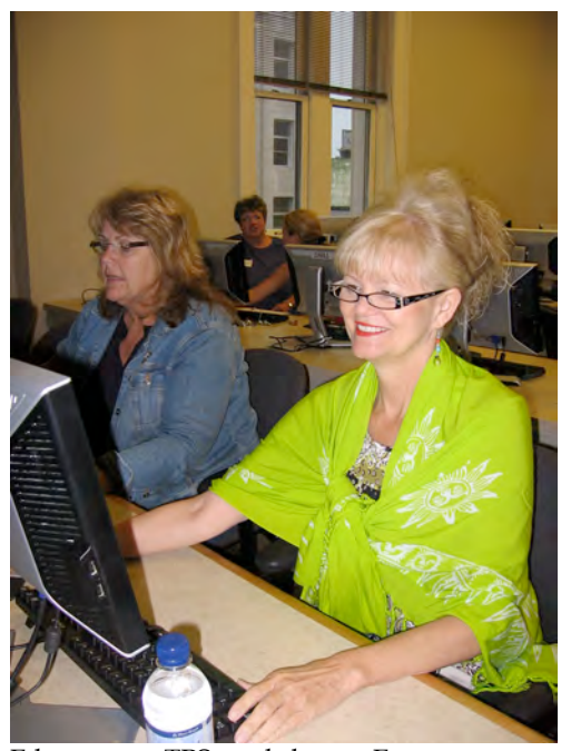
Educators at TPS workshop at East Tennessee Historical Society, Knoxville

Heritage education remains a foundation program for the CHP. Following MTSU's Academic Master Plan, the CHP continues to provide student-centered, experience-based educational opportunities for undergraduate, masters, and Ph.D. candidates as it serves Tennessee and southeastern communities and institutions. Ph.D. students received research funds and extensive CHP instruction for their research projects, which included a DVD film for the Mississippi Blues Trail; research and expansion of the Tennessee Century Farms Program; sustainable tourism research in Cocke, McNairy, and Sevier counties; and historic resource surveys in Gatlinburg and surrounding Appalachian communities.