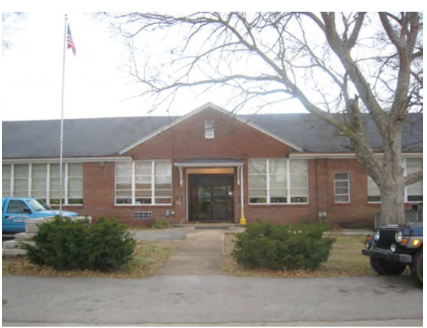
Townsend Rosenwald School, Winchester

The Center meets its goals and objectives through projects and programs that focus on the heritage development—the identification, research, preservation, interpretation, and promotion—of our historic environment. Through its varied resources, and its partnerships at local, state, and national levels, the Center responds to the requests, needs, and concerns of communities, individuals, agencies, and organizations, both governmental and not-for-profit, working towards historic preservation goals.