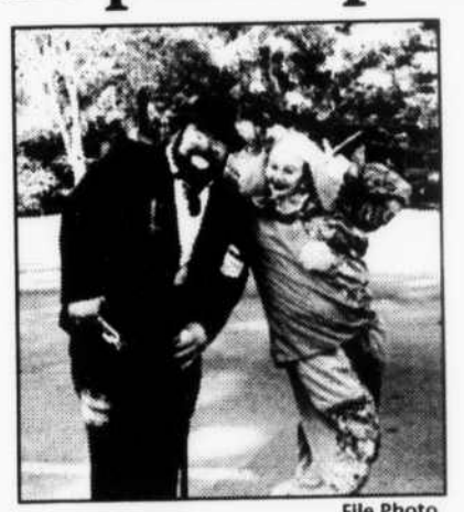
Some people go all out for Homecoming Week. There's even an award for those groups that give it their all.

In addition, groups can get points for participating in Special Olympics Bowling, the step show,