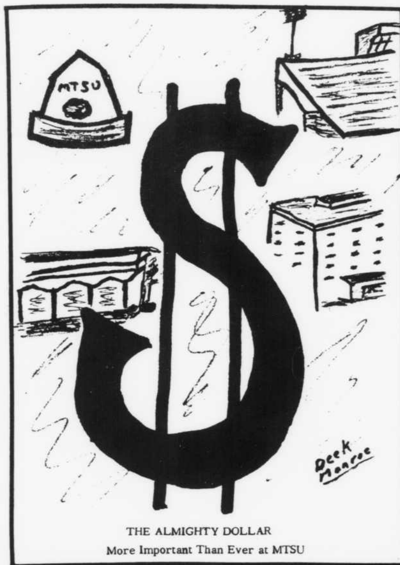
THE ALMIGHTY DOLLAR More Important Than Ever at MTSU

But by now more senators are wondering whether the appearance of conflict of interest means anything at all. And when the Haynsworth inquiry is over, they will begin to wonder whether the true role of the Department of Justice is to defend justice or make and unmake justices.