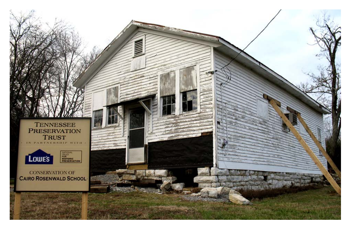
Sumner County's Cairo Rosenwald School as stabilization began in December 2008.

The Center for Historic Preservation is pleased to partner with Tennessee Preservation Trust and the Cairo Rosenwald School in Gallatin, one of several Rosenwald Schools selected to receive a generous restoration grant from Lowe's and the National Trust for Historic Preservation. The Cairo Rosenwald School, located just outside Gallatin in Sumner County, is owned and maintained by the Cairo Improvement Club. Trustees worked with the center and the Tennessee Preservation