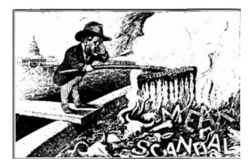
Figure 2.2: Teddy Roosevelt the Muckraker (Utica Saturday Globe, 1906)

During his tenure as president, Roosevelt was able to pass several reformations such as The Pure Food and Drug Act (FDA), Anti-Trust Laws, and the Meat Inspection Act (MIA). After reading Upton Sinclair's book, The Jungle (1906), Roosevelt called for radical action to take place in the meat-packing industry. As a leading force in the Progressive Era, Theodore Roosevelt not only cleaned up the muck and corruption in the nation, but he helped preserve the nation's greatest environmental treasures through his national parks initiative. By daring greatly, he was truly a steward of the people (The White House, 2015; Griggs, 2013, "Citizenship, Character, and Leadership: Guidance from the Words of Theodore Roosevelt").