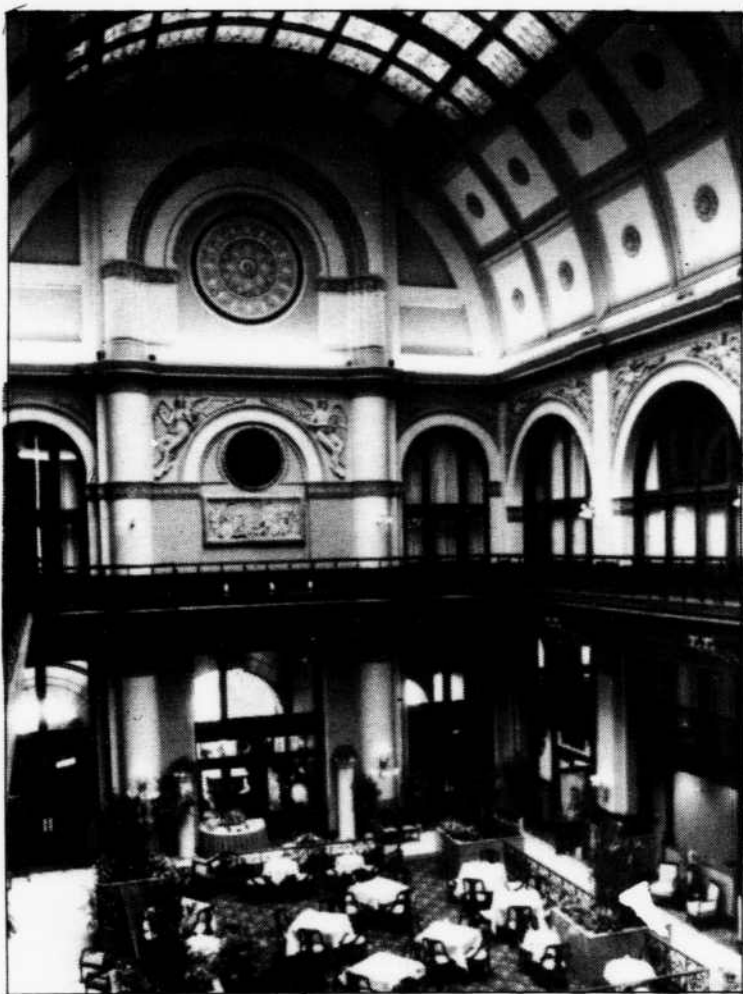
The recently reopened Union Station Hotel welcomes guests to downtown Nashville. The train station now houses several restaurants and a luxury hotel.