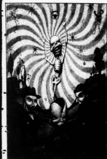
CHRIS BELL Features Editor

Editor's Note: In our continual quest to make entertainment choices as easy as possible, Sidelines introduces our new Five Yo review system. Remember, if it's five Yo's it's got to be good.