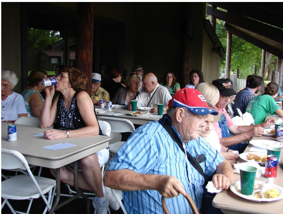
Figure 7. A picnic for interviewees and their friends and families was one of the highlights of the Heritage Day celebration.