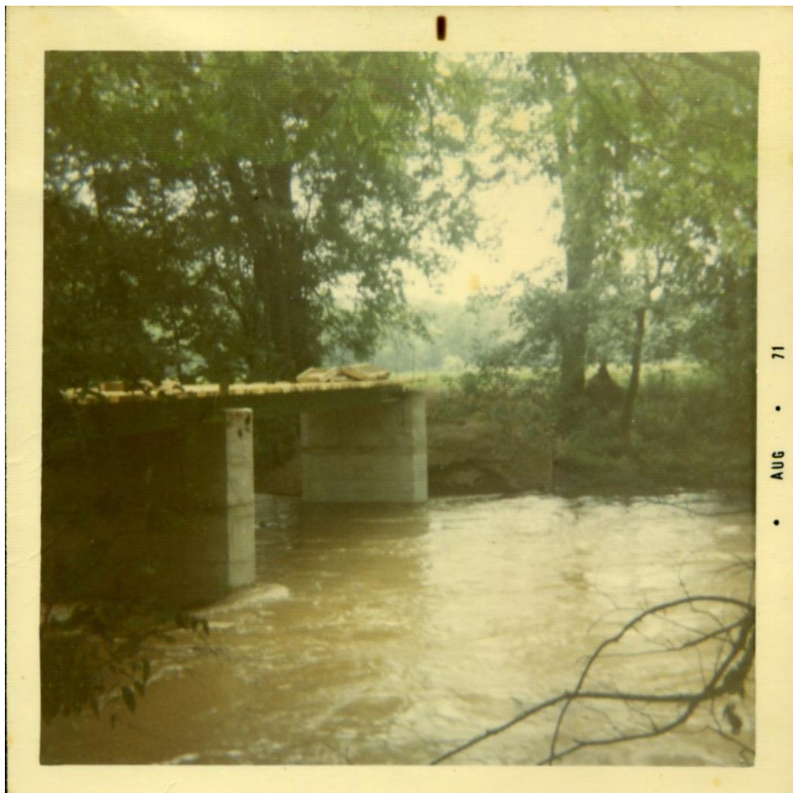
Figure 4. Water rises under a partially dismantled bridge.