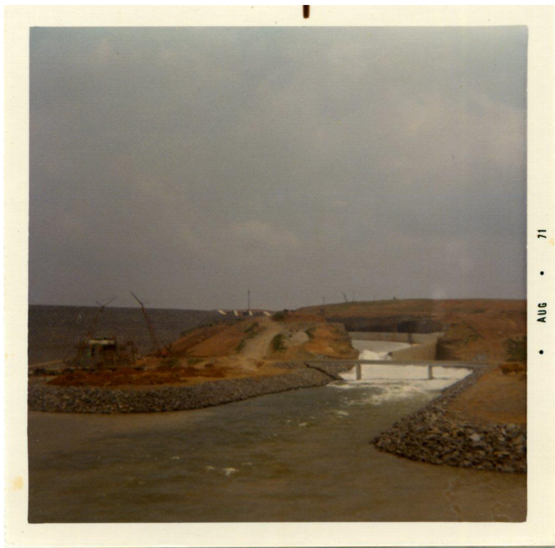
Figure 3. Photograph taken by Clay Ervin the day the dam was closed and the reservoir began to fill. Courtesy of Clay Ervin.