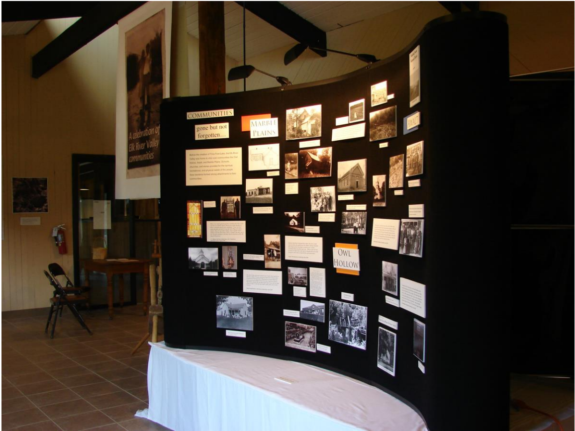
Figure 5. Heritage Day exhibit displayed in the recreation building at Tims Ford State Park.