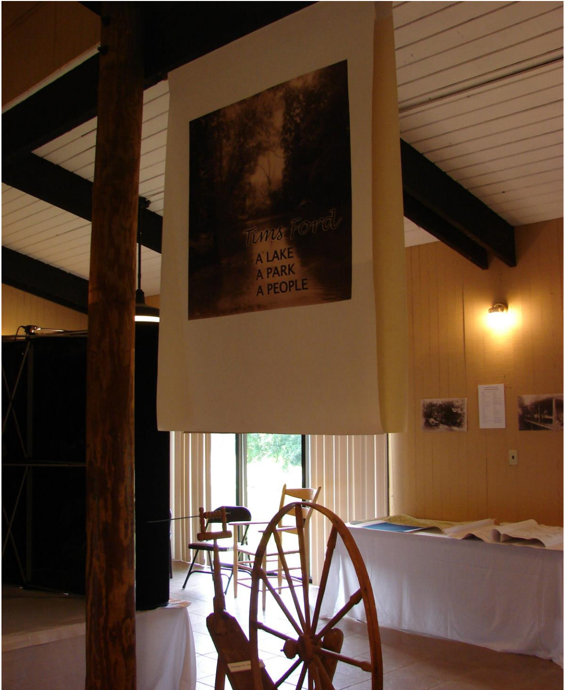
Figure 6. Large graphic banners, artifacts, and maps enhanced the Heritage Day exhibit.