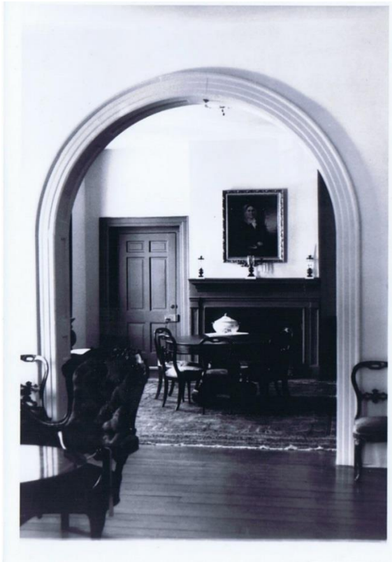
Figure 9: Parlor and dining room of the Polk Home, showing door that leads outside to kitchen building, circa 1970, 11

The executive staff of the Polk Home obviously needs to address the story of the enslaved people who belonged to Polk and his family, but some issues do arise with this necessary action. Some of the research is there, and there is plenty of information about the Polk family and the enslaved people who they owned. However, the docents at the Home pose a problem. Most of them are anywhere from their sixties to their eighties in age, and most of them were born and raised in the South. One docent has mentioned to me several times how slavery was not a cause of the Civil War, and I have heard many of