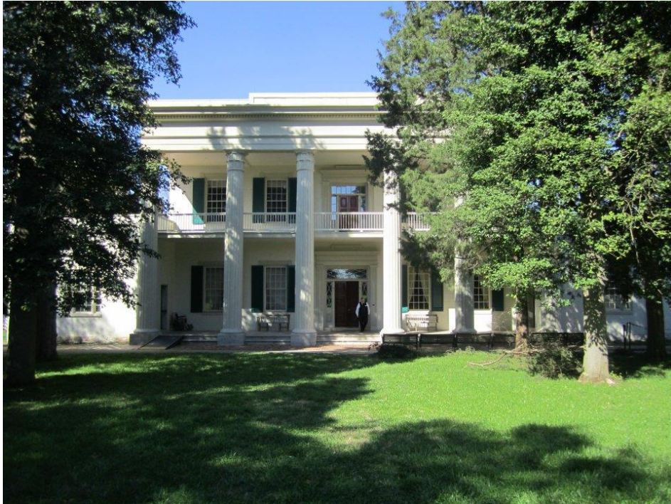
Figure 1: The Hermitage, Home of President Andrew Jackson

Andrew Jackson is one of the most controversial historical figures in United States history due to his status as a hero and a villain all at once. This is due, in part, to his dealings with the institution of slavery both politically and personally. This chapter covers the history of Andrew Jackson and slavery, how The Hermitage, his home in Nashville, Tennessee, has handled the issue over the years, how it handles it currently, and how it does and does not do it well.