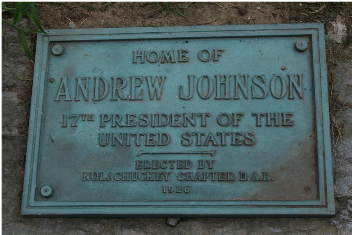
Figure 10: Daughters of the American Revolution historical marker at the Homestead of the Andrew Johnson National Historic Site

Andrew Johnson was not born into a successful family like James K. Polk. He had much more humble beginnings, more akin to those of Andrew Jackson, though he was never in the military, and he certainly did not become a hero to the American people. Attitudes toward Johnson as a president have evolved over the years, but he still is not considered anywhere near the level of the “great” presidents. His beginnings and his long struggle to climb the social ladder shaped his views and his actions for the rest of his life, especially in regards to slavery. His father died when he was three years old in 1811, and he lived in poverty with his mother and had to start working as a tailor’s apprentice at age nine to ease the strain on his mother’s finances. His wife Eliza, who he married in 1827, was responsible for most of Johnson’s literacy skills. He entered the world of politics in