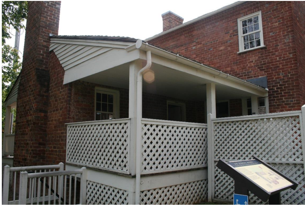
Figure 11: The “Early Home” at the Andrew Johnson National Historic Site

“The Homestead” is the home that the Johnsons owned from 1851 to 1875, and it is located just a couple of blocks away from the Visitor Center at the Andrew Johnson National Historic Site. For most visitors, this is the main attraction of the site since it is the home where the Johnsons lived at the start of the Civil War, and it is the home in which visitors receive a guided tour from a park ranger. On the tour of the Homestead, park rangers cover the history of Andrew Johnson’s marriage and family, including deaths, addictions, illnesses, and war. The Homestead tour focuses quite a lot on the effects of the Civil War on the Johnsons, their home, and their state. Since the Homestead was occupied by Union soldiers during the Civil War, guides go into detail about the disrepair of the home after the war and the graffiti that was left throughout the house,