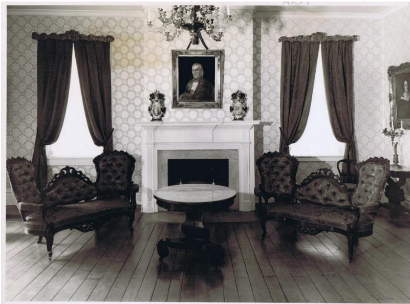
Figure 6: Parlor of the Polk Home, circa 1942, from the collection of the James K. Polk Memorial Association.