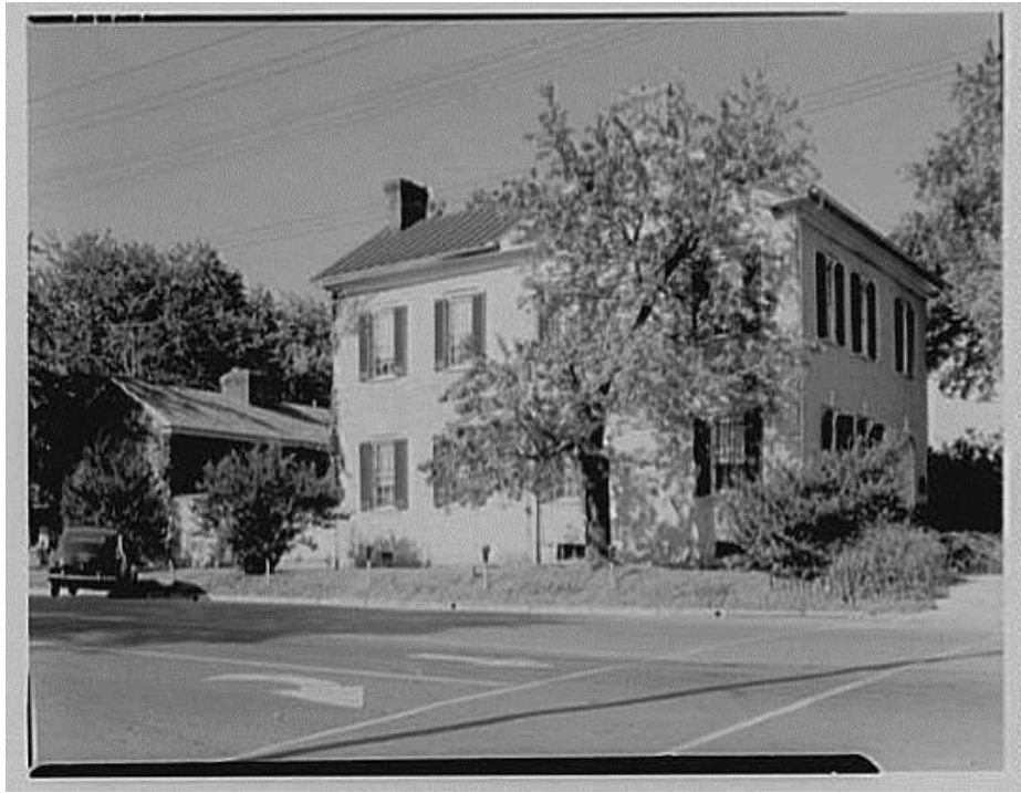
Figure 4: Side view of the Polk Home with the kitchen building in view, circa 1961, from the collection of the James K. Polk Memorial Association.

In an effort to introduce slavery interpretation at the site, a temporary exhibit went up in Polk Presidential Hall, the Home's exhibit hall, entitled "A Matter of Utmost Caution: James K. Polk and Slavery" from December 2011 to March 2012. It went into great detail about Polk's slaveholdings and his dealings with the institution both publicly and privately. The intention is for some of the panels to be placed in the kitchen building at the Home so that the African American story can become a permanent part of the tour. However, that would still create an atmosphere of segregated knowledge at the Home, and it would be much better to integrate the story into the spoken tour. This may be a problem with some of the "Old South" docents that work at the Home, however.