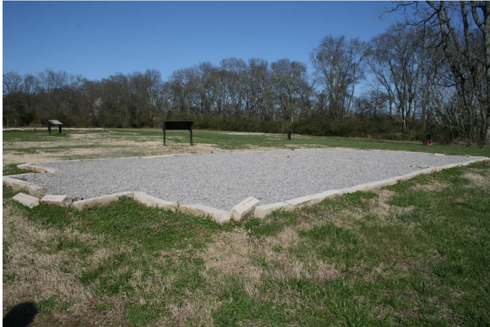
Figure 2: The layout for the field slave quarters as evidenced through archaeological research at The Hermitage, photo by Lauren Baud.

house is lacking depending on the tour and tour guide. Using more of the archaeological research from the sites near the house would help with telling the story of the house slaves at The Hermitage.