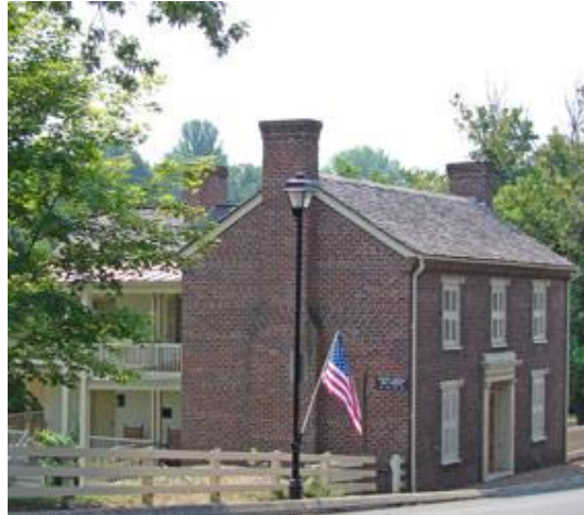
Figure 12: The “Homestead” at the Andrew Johnson National Historic Site, from the collection of the Andrew Johnson National Historic Site.

including the phrase “the old traitor,” which you can still see in an upstairs bedroom. The rest has since been covered with wallpaper.