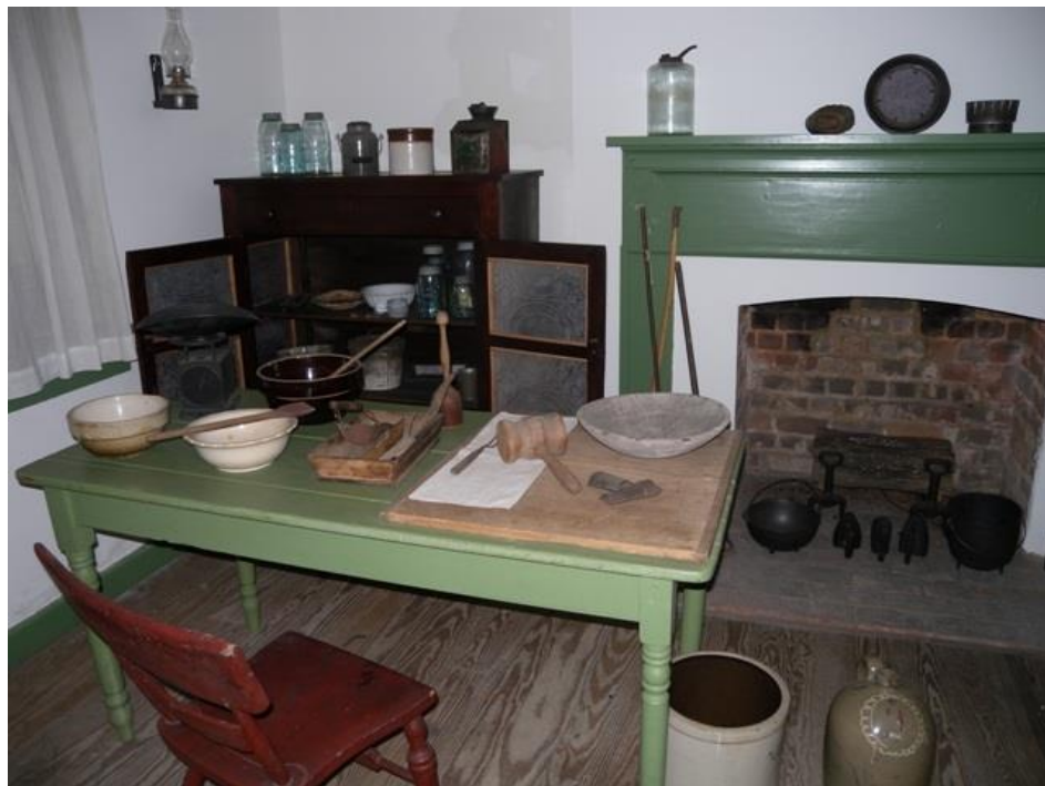
Figure 16: The Kitchen of the Homestead at the Andrew Johnson National Historic Site, from the collection of the Andrew Johnson National Historic Site.