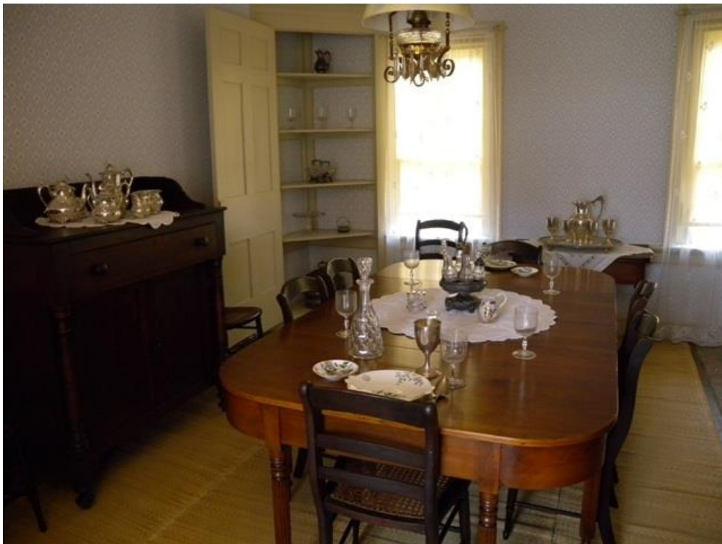
Figure 14: The Dining Room of the Homestead at the Andrew Johnson National Historic Site, from the collection of the Andrew Johnson National Historic Site.