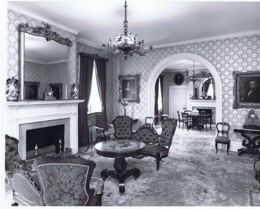
Figure 7: Parlor of the Polk Home, circa 1970, from the collection of the James K. Polk Memorial Association.

On the tour at the home, most of what the docents discuss is based on Polk's family life and political career, yet they say that they cannot discuss slavery because there are no artifacts related to the enslaved people who worked there. Some staff make the argument also that the enslaved people who worked at the Polk Home lived off-site, thus making it irrelevant to discuss their story because they did not physically live in the house. If this argument is to stand, then there should also be no discussion of Sarah Polk in the home either because she did not ever live in the house in question. However, she is pretty much the only topic discussed in the upstairs rooms of the house. To remedy this problem, docents need to discuss the structure of the home and how it was built. They need to discuss the work that went on in these rooms in addition to the family life that