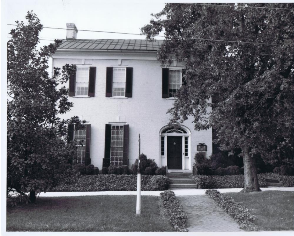
Figure 5: Exterior of the Polk Home, circa 1970, from the collection of the James K. Polk Memorial Association.