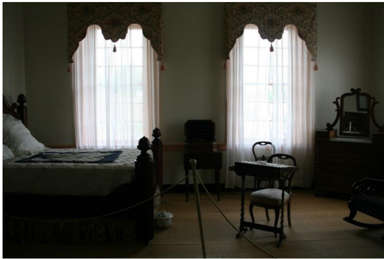
Figure 8: Bedroom in the Polk Home, showing chamber pot, 2010.

took place there, like most of them do. 10 A very good place to do this is the dining room, which has a door that leads out to the kitchen building. This door served as a major piece of my interpretation at the Home when I worked there, and it helped to open up the communication about slavery with visitors. The chamber pots and fireplace equipment upstairs are also very good jumping off points for discussing the issues of slavery in the Home. Thus, there are actually many avenues to discuss slavery