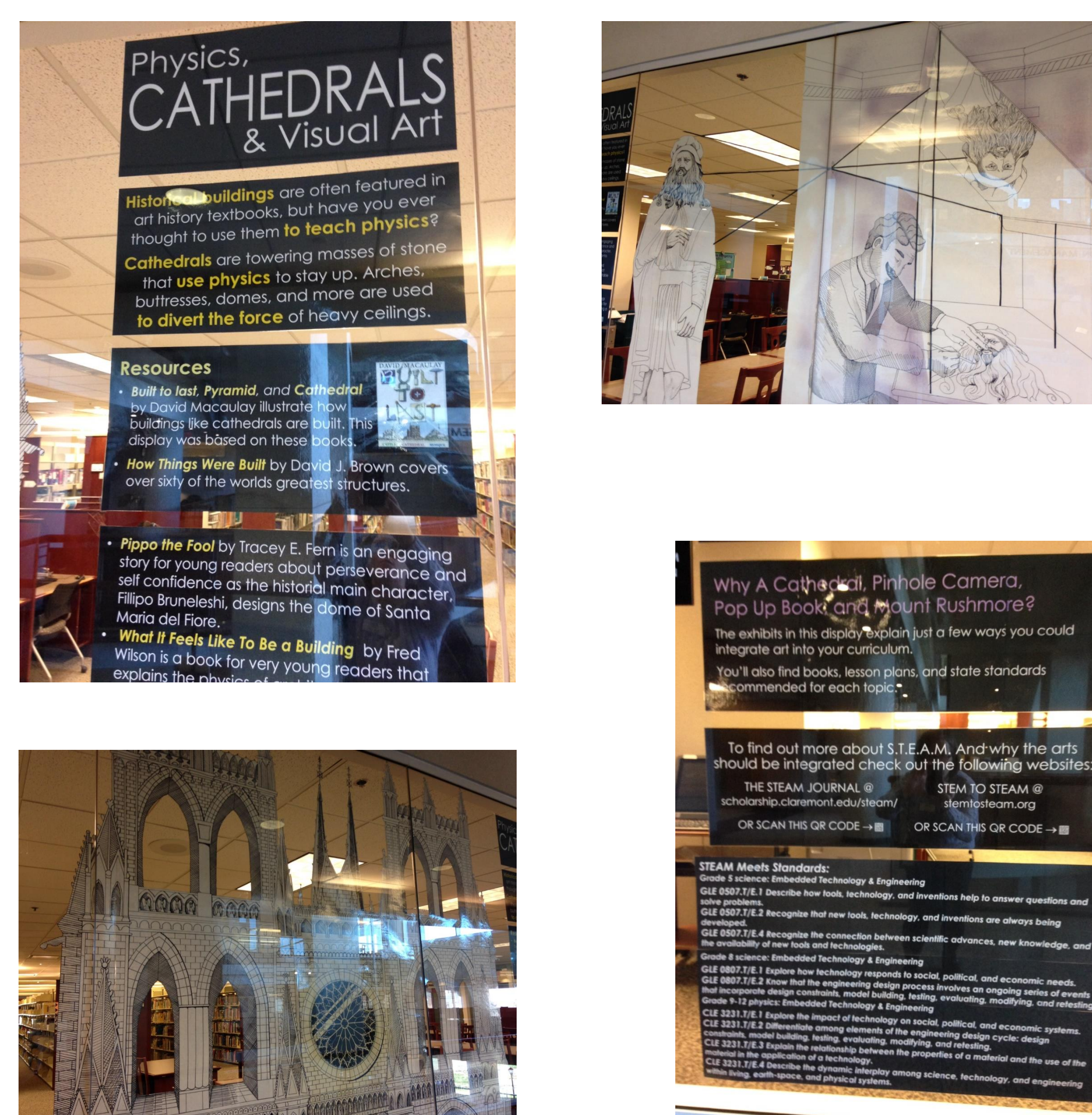
A favorite past art display: includes art work as well as K-12 state standards explanation.

The portfolio is helping our current student artist with her planning skills as she designs a space-themed display. The project has also strengthened her library research skills, as she has utilized library resources for her planning as well as an accompanying book display. The biggest improvement has been an increase in communication between the library supervisor and the student artist.