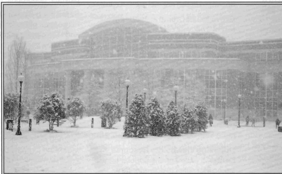
A rare Tennessee snowstorm closed the library on January 16.

Consideration is being given to extending hours to 1:00 a.m., similar to the extension adopted last term.