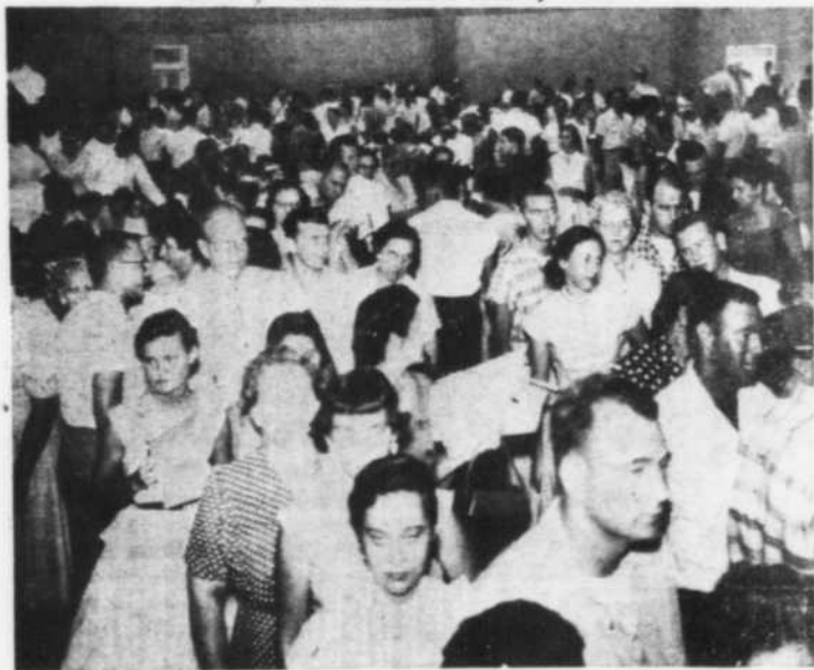
This is a general view of the first term summer school registration, a scene that may be duplicated in the Library Wednesday, July 18. Registration for the second term will be held in the Library since the Tennessee Room will be in use.