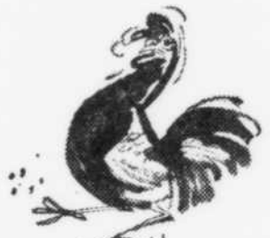
cross the road