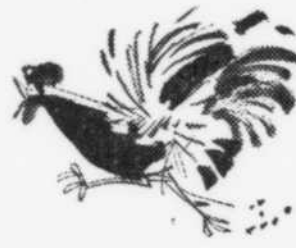
in front of Chevrolets