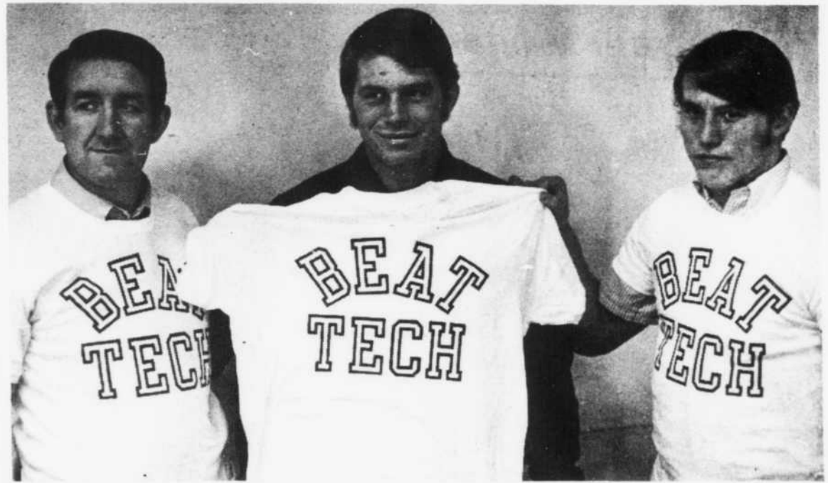
Psyching boys up

"They are a much better team than that," declared Peck. "They will really be pulling out all the stops against us."