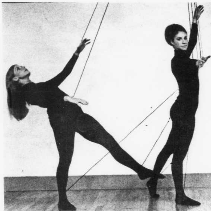
Dancers in 'Preview'

The concluding performance will be "A Societal Purgatory," which is a social commentary.