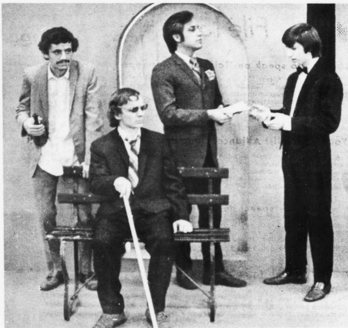
'Dinny' to open

He concludes that marijuana legalization should at least be postponed until its effects are more completely understood.