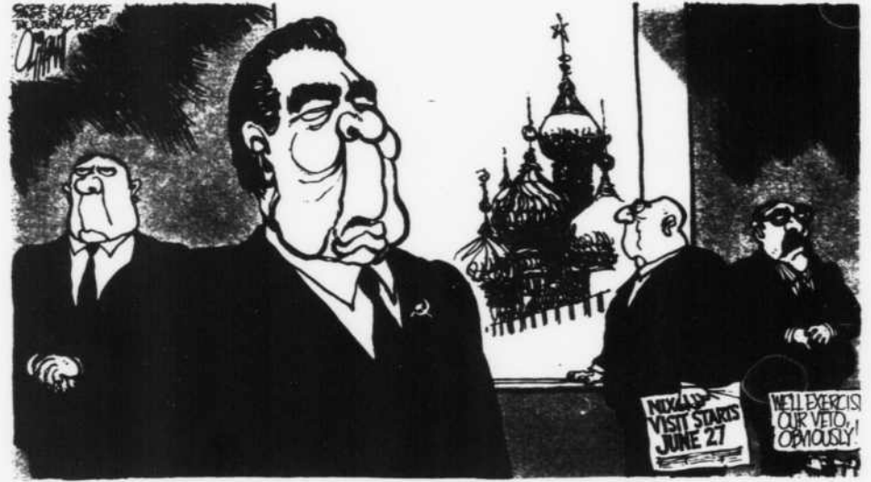
'WHAT IF THE DAMN TROUBLE-MAKER ASKS FOR ASYLUM . . . ?'