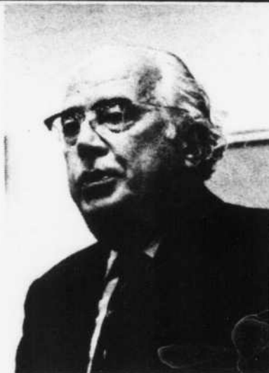
Sir Geoffrey de Freitas

After an informal reception directly following the discussion, de Freitas returned to Washington, D.C. briefly before visiting the United Nations.