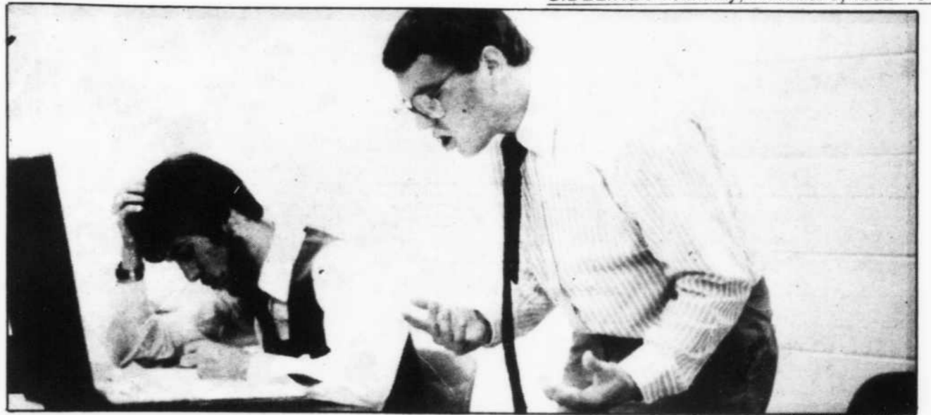
The first intercollegiate debate tournament was held here Saturday through Monday attracted debaters from all over the United States. The debate topic concerned U.S. foreign policy with the military.

"THE RIGID schedule sometimes presents problems," Brooks said. "But these students are super-achievers and this is all they do. This is their social life. As a rule, they are very successful people."