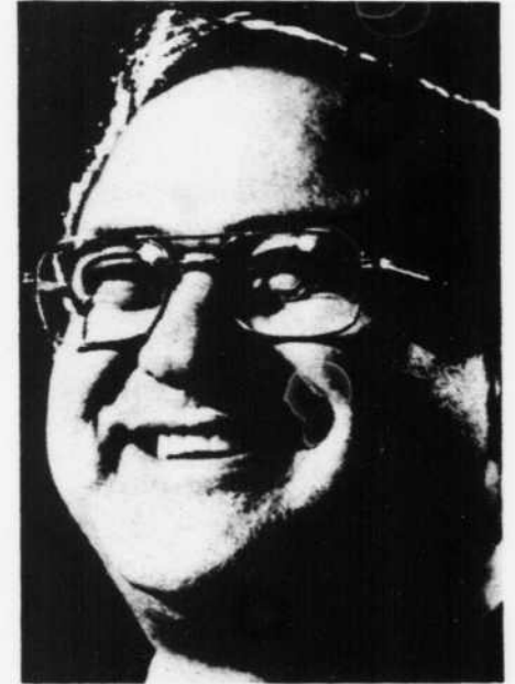
Sen. James Abourezk