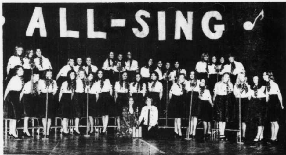
Chi Omega sorority, winner of the female chorus award in Thursday night's All-Sing, wore 1940 style costumes for their rendition of "Dreams" and "Mr. Sandman." Sigma Alpha Epsilon fraternity and the Church of Christ Student group were also winners in the event.

JACKSON HEIGHTS PLAZA MURFREESBORO, TENNESSEE