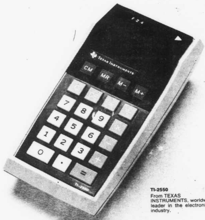
TI-2550 From TEXAS INSTRUMENTS, worldwide leader in the electronics industry.

No waiting for delivery. Your University Calculator Center has the largest inventory of quality units available anywhere. Plus, we specialize in the calculator requirements of the college student.