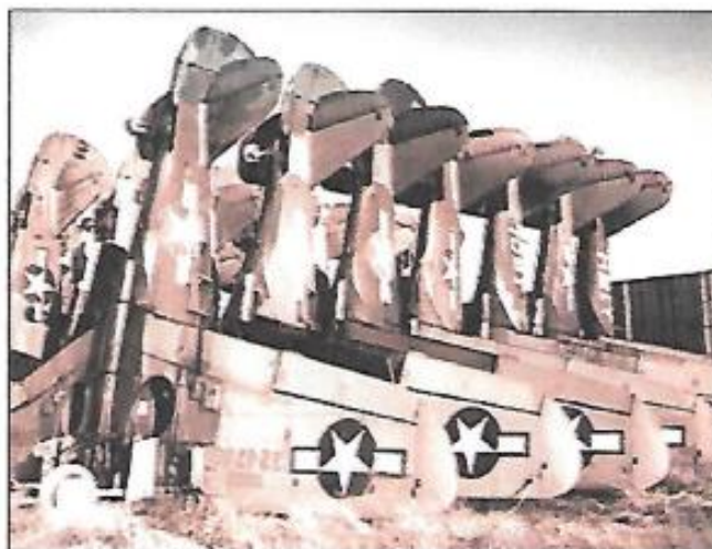
Curtiss P-40 Warhawk fighters stacked vertically at Walnut Ridge, Arkansas after World War II

Some U.S. military aircraft overseas were not worth the time or money to bring back to the States, and were consequently buried, bulldozed or sunk at sea. Most, however, were returned home for storage, sale or scrapping.