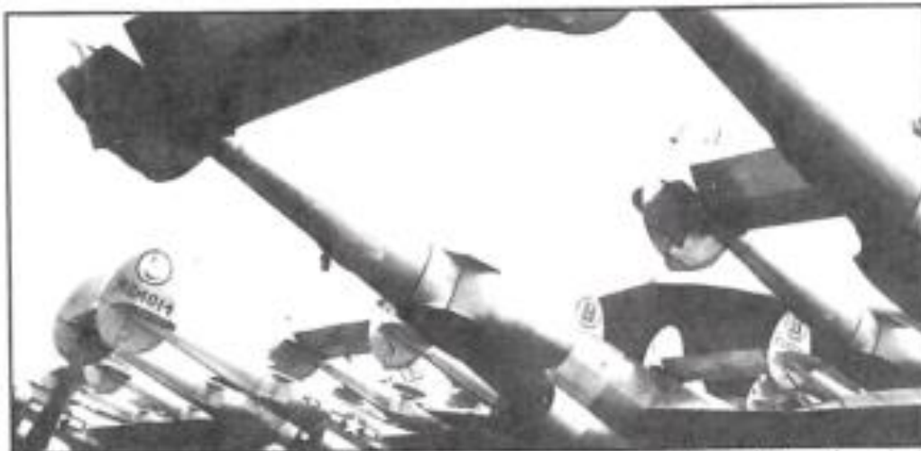
The fate of virtually all Sixth Air Force Lockheed P-38J and P-38L "Lightnings," which saw only 11 months service in Sixth Air Force before being scrapped en masse. The distinctive circled letters on the fus of these aircraft represented Squadrons of XXVI Fighter Command