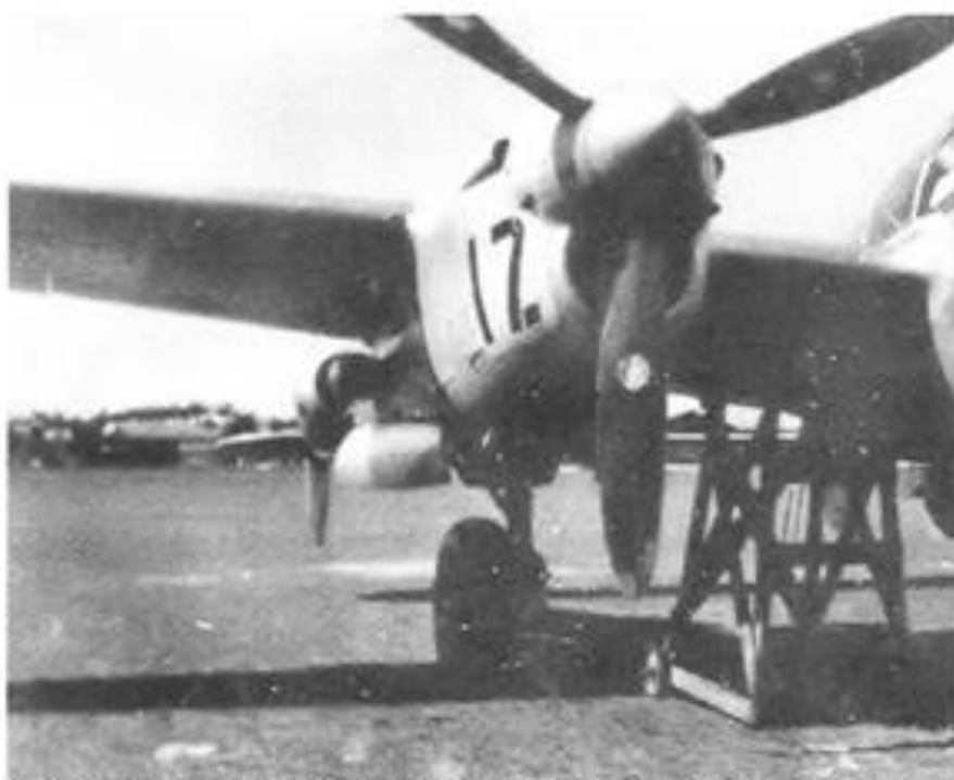
24th Fighter Squadron P-38J Lightning (Squadron #12), France Field, Panama,