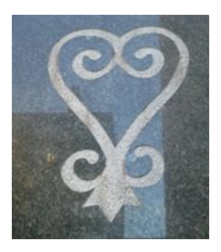
Figure 1: Sankofa

bird which appears to be moving forward while looking back, supporting the idea of incorporating the aspects of the past into the future. Furthermore, this symbol bears resemblance to the symbols that enslaved Africans retained despite subjection. <sup>37</sup>