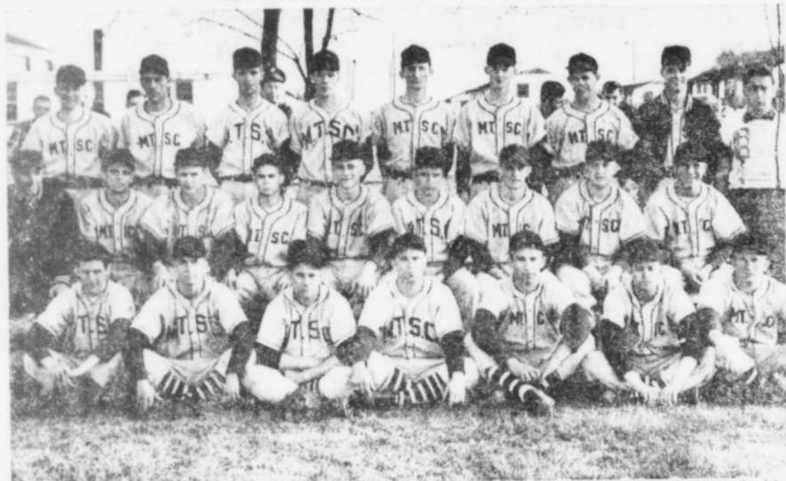
MTSC will play its first OVC opponent... Shradder, Osteen were Outstanding Raidermen