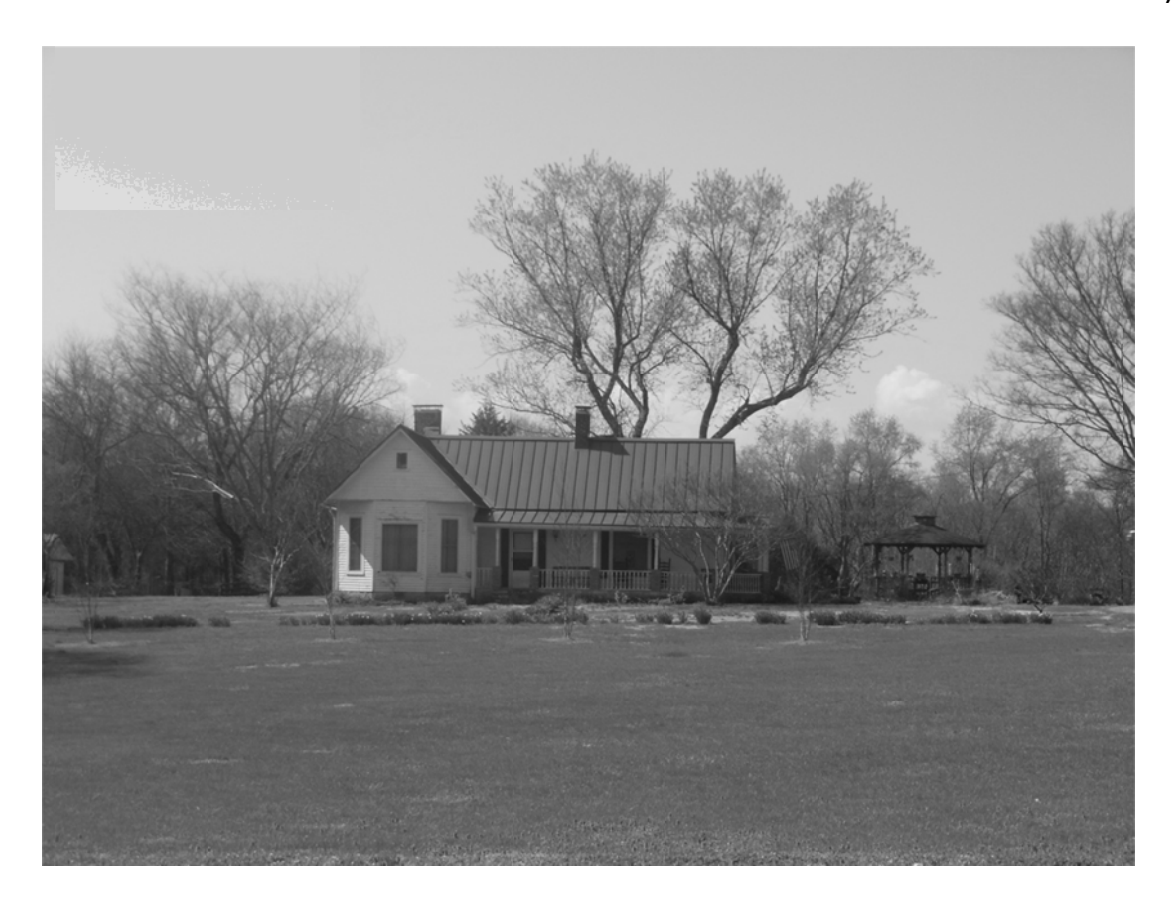
Figure 6. Original Parsonage for Powell's Chapel. Photograph by author, 2014.