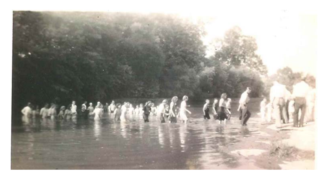
Figure 4. Powell's Chapel Baptism in Stones River, August 1941.