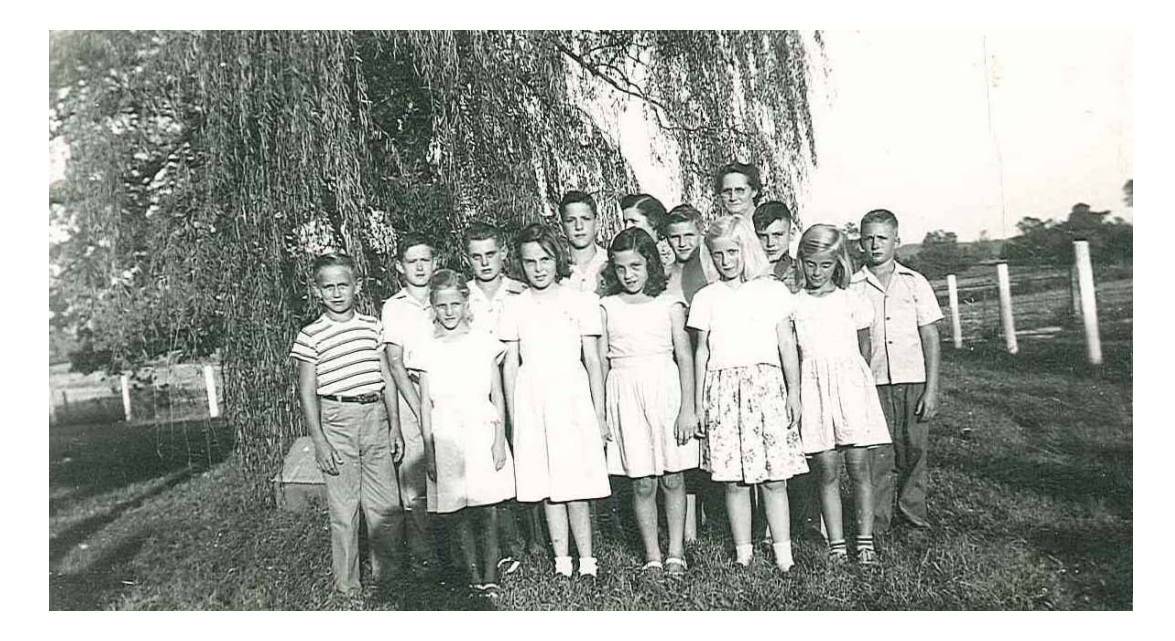
Figure 5. Children's Training Union class at Powell's Chapel, September 1948.

we Middle Tennesseans had a closer look at what was happening in the war; our soldiers were a daily reminder.<sup>36</sup>