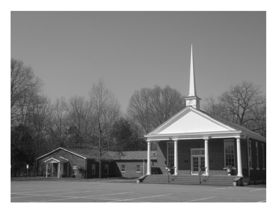
Figure 9. Powell's Chapel Baptist Church, 2014.

congregations, the increasing number of rural churches closing their doors provides great motivation for researchers to capture the history of these congregations before the historical records disappear.