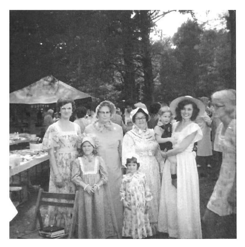
Figure 8. Women dressed up for the Centennial Celebration, July 1975.

when his folding chair got too close to the edge. The church and community enjoyed celebrating a century of successes.<sup>46</sup>