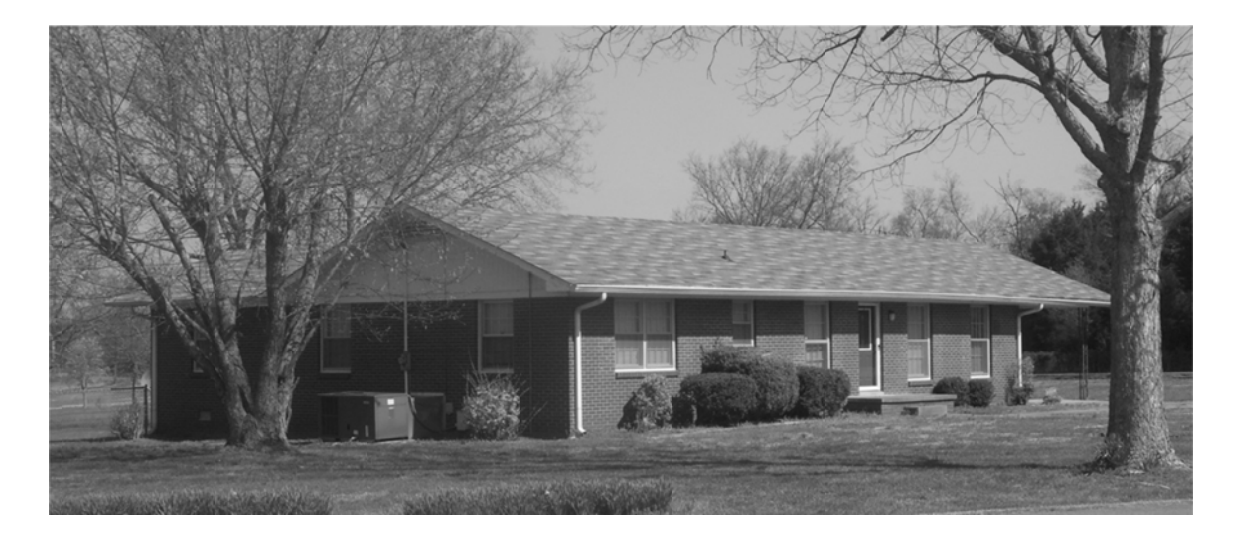
Figure 7. 1963 Parsonage. It is currently used as a ministry house for the church with a food pantry and clothes closet. Photograph by Author, 2014.

conditioning. The work of the Church Development Committee, the Building Committee, and the deacons played a great role in updating the church building and stimulated the changes that would continue to transform the church from a typical country church into a modern congregation.<sup>25</sup>