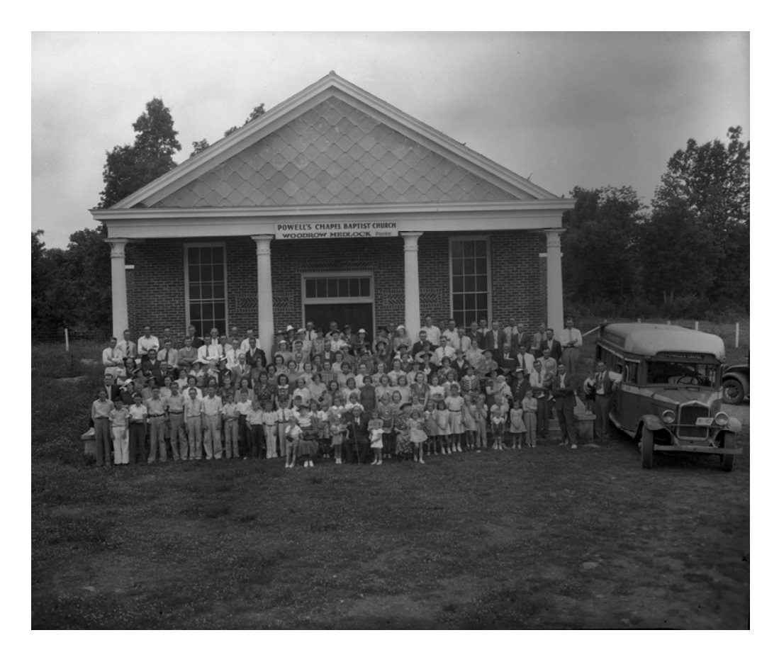
Figure 3. Powell's Chapel Church members posing with the new bus in 1939.