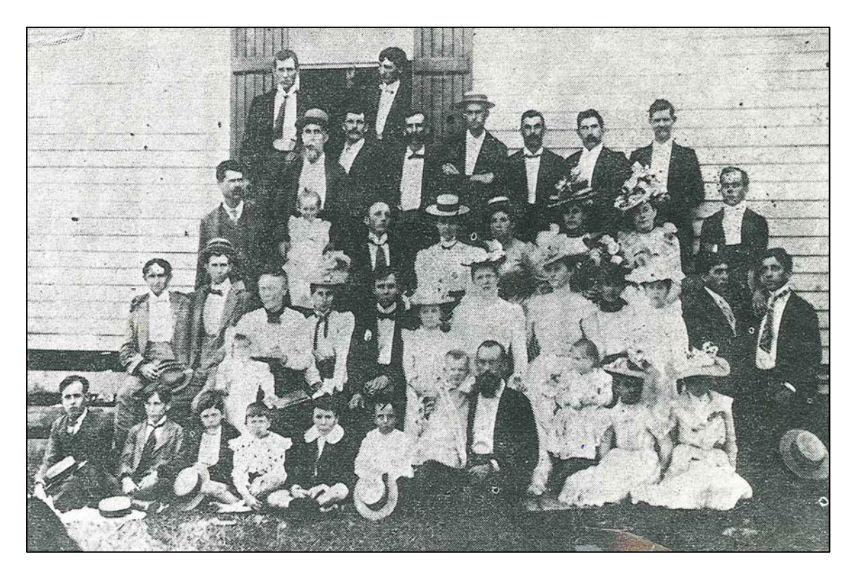
Figure 2. Earliest known photograph of Powell's Chapel Baptist Church Sunday School, circa 1900.