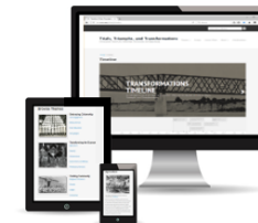
Image (left) used Storymaps and GIS. Image (right) is the Trials, Triumphs, and Transformations collection, which won honorable mention for the ASA Garfinkel Prize in Digital Humanities in 2018.