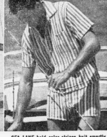
SEA LANE bold color stripes knit smartly of 100% cotton in combinations of *orange, blue or yellow. Bottom band cardigan Jacket $7.95 atop Hawaiian length trunks $6.95.