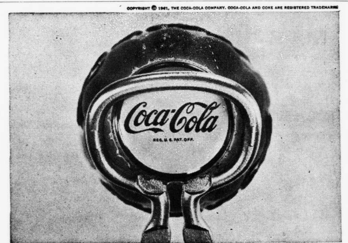
OPEN WIDE and SAY A-H-H-H! Get that refreshing new feeling with Coke!

SOUTHWEST TEACHERS' AGENCY 1303 Central N.E. - Albuquerque, N. M. Serving Southwest, Entire West and Alaska FREE REGISTRATION Member: N.A.T.A. - Salaries $4600 Up