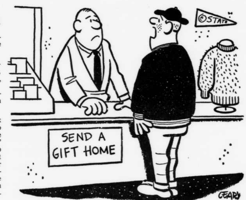
"I want to be wrapped in blue. I just received my flunk-out notice."

It seems that our supposed "freedoms" have somewhere been lost along the way when people are for all to hear.