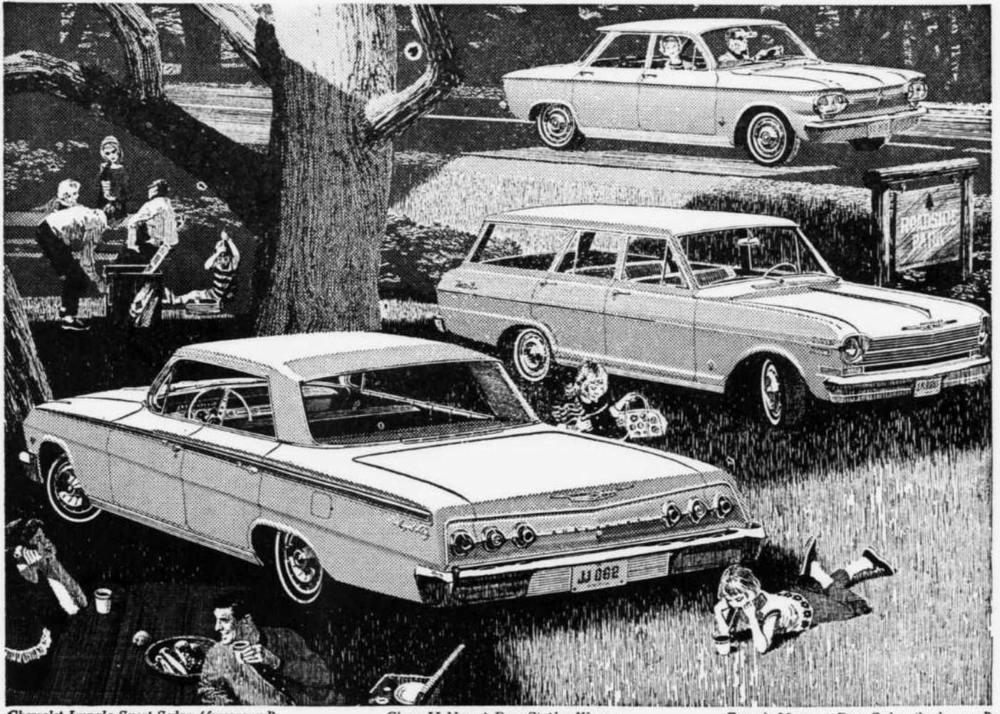
Chevrolet Impala Sport Sedan (foreground)