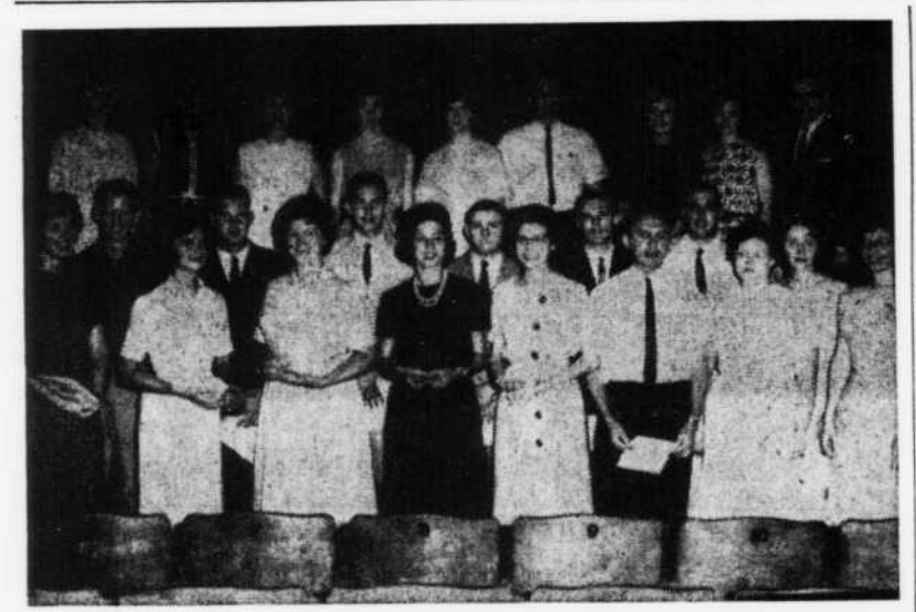
Thirty-two students recognized by the Who's Who in American Colleges were honored during the Honors Day ceremonies.