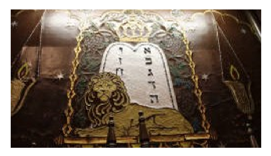
Figure 2: Temple Emanuel in Beaumont, Texas, interior, torah ark lining, detail. https://digital.mtsu.edu/digital/collection/dasi/id/9/rec/33