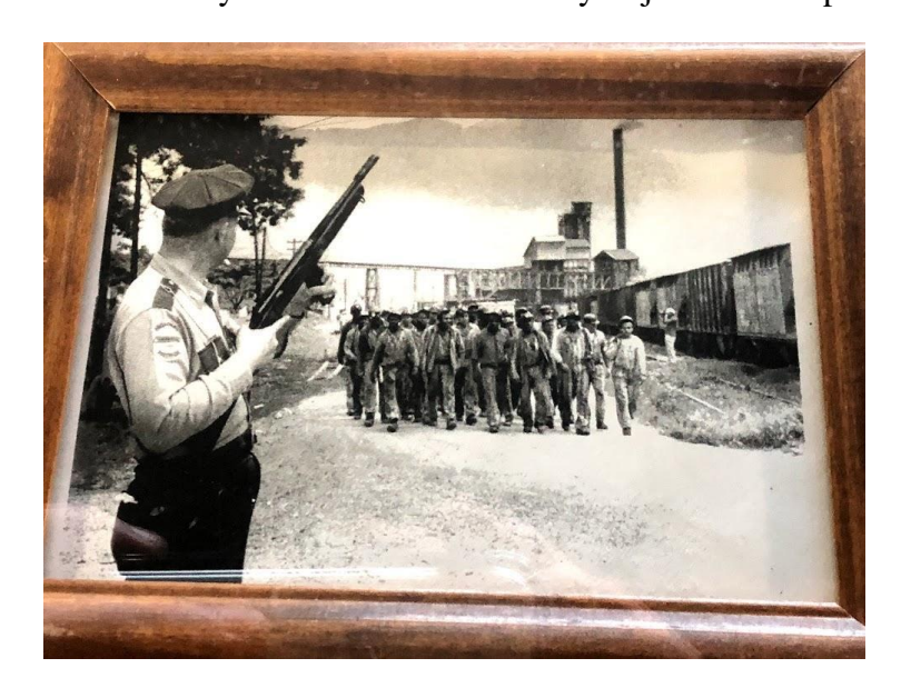
Figure 8. This photo depicts convict laborers at Brushy Mountain State Prison returning to prison after a sit-down strike. <sup>102</sup>