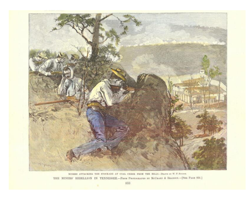
Figure 6. A depiction of the Coal Creek Wars from an 1892 Harper's Weekly issue. 91

marched the convicts back to the mines, the convicts were once again shipped to Knoxville on a train. Following a failed legislator's promise to repeal the convict lease, from 1891-1893 a series of conflicts broke down in the Coal Creek area: "The legal system had failed the miners, and they went to war ... the miners liberated convicts, burned stockades, and fought running battles with the state militia." <sup>90</sup>