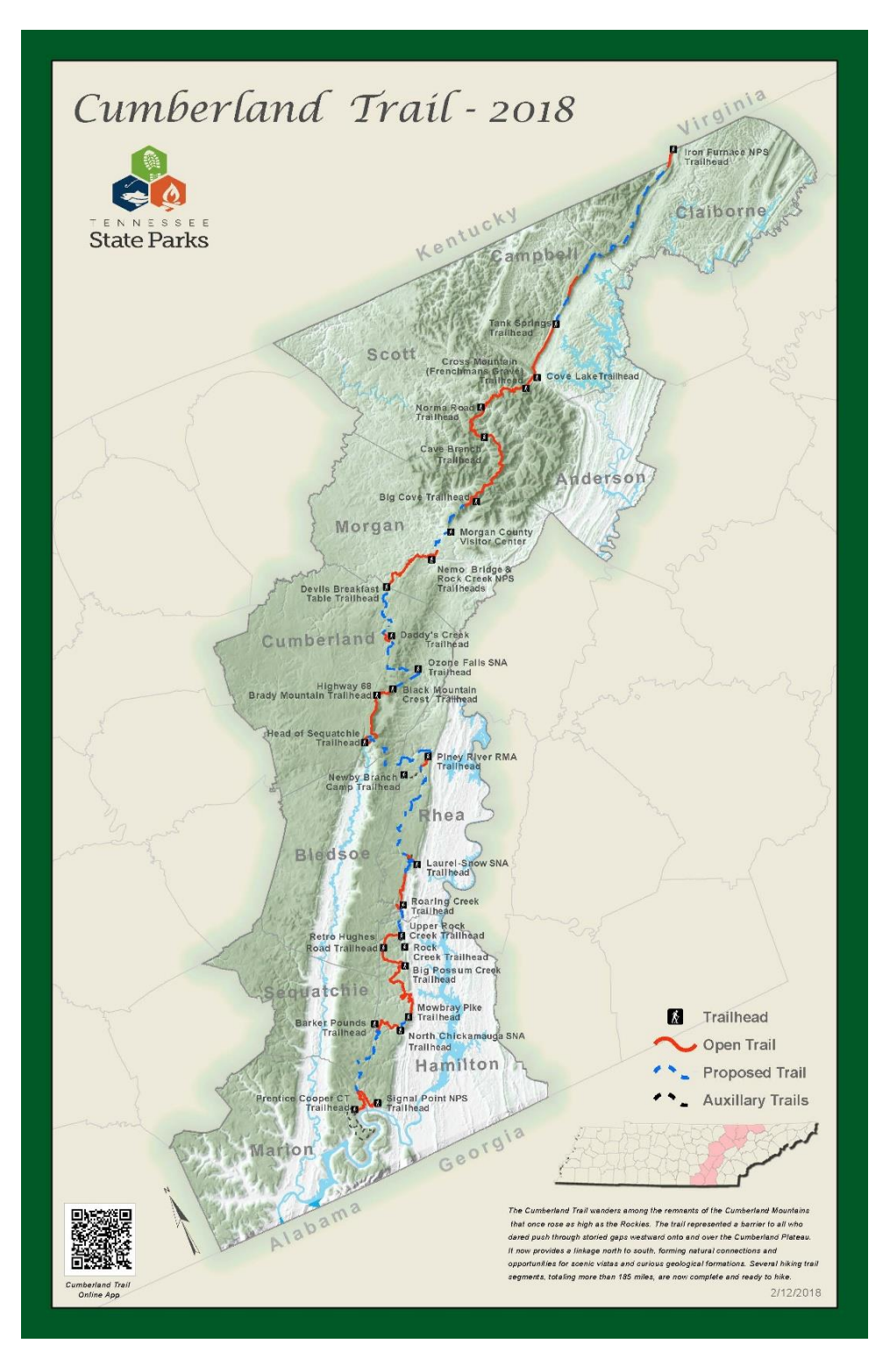
Figure 2. Map of the status of the Cumberland Trail in 2018. The completed trail will cover about 350 miles.<sup>5</sup>

<sup>5</sup> "Cumberland Trail – Overview," Trail Maps, cumberlandtrail.guide, last updated Feb. 12, 2018.