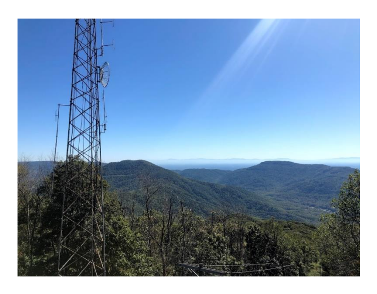
Figure 5. The Cumberland Mountains feature some of the most rugged terrain on the Cumberland Trail. Photo by the author, Oct. 14, 2019.

Conservancy, and Foothills Land Conservancy.<sup>73</sup> The CT works with various state agencies as well.<sup>74</sup> Estimates for the trail's completion are around 2022.