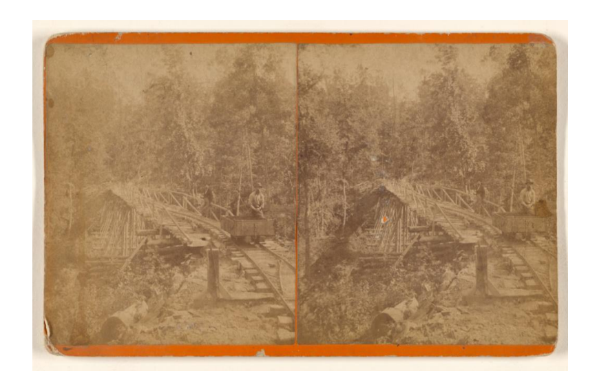
Figure 7. A photo of the Lone Rock Mine in Tennessee taken in the 1890s. 98

The song, "Last Payday at Coal Creek", lends a historical account that was the result of a mine explosion in 1902 at Fraterville that "busted the company" according to folk musician Pete Steele, who made the song popular: