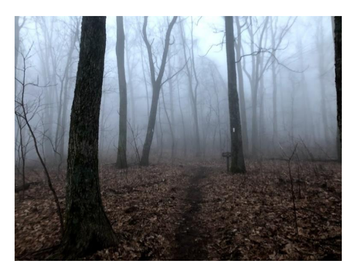
Figure 1. On the Cumberland Trail at Black Mountain, looking northbound. Photo by the author, Mar 12, 2020.

The Cumberland Trail, an under-construction state scenic trail in Tennessee, exhibits potential in developing cultural heritage tourism that departs from outsider-constructed identities and instead empowers the bearers of local culture. This thesis seeks to close the gap between Appalachian studies and heritage tourism while applying concepts from both in the context of the Cumberland Trail.