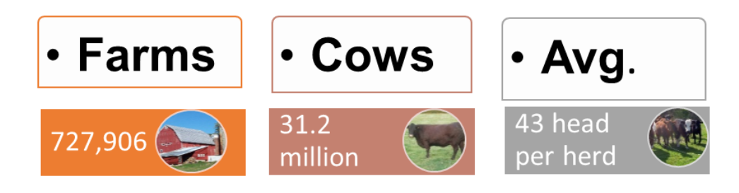
Figure 3: Herd Sizes in The U.S.