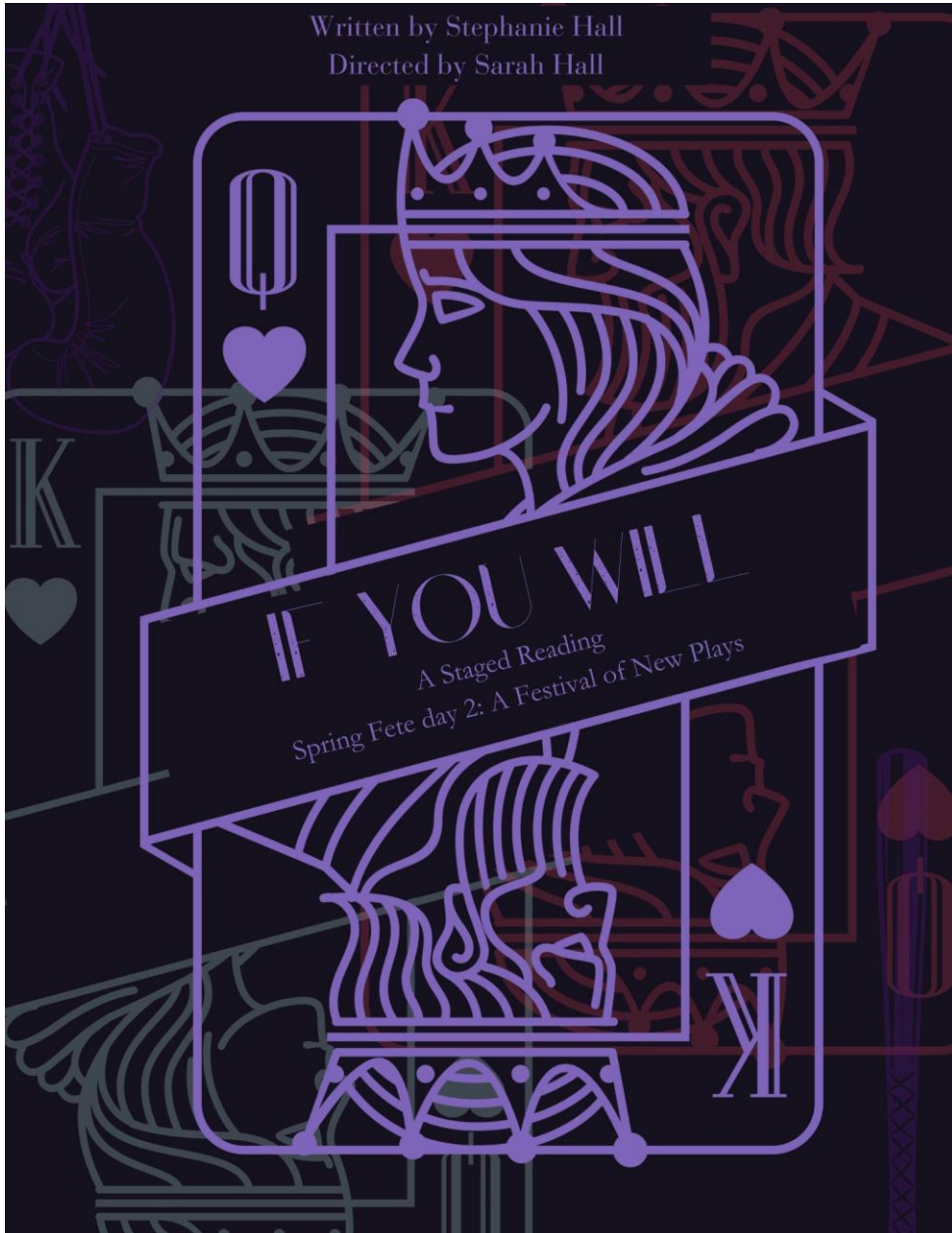
Figure 2: If You Will Promotional Poster