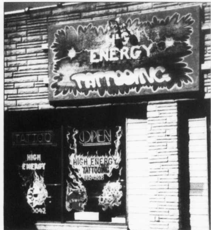
High Energy, located near campus, offers customers an alternative to the satanic images usually associate with tattoo parlors.