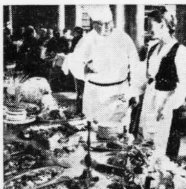
Learning about a European buffet.

Further information and application materials may be obtained from the Fellowship Office, National Academy of Sciences-National Research Council, 2101 Constitution Avenue, N.W. Washington, D. C. 20418. The deadline for the receipt of applications for graduate fellowships is December 11, 1964, and for regular postdoctoral fellowships, December 14, 1964.