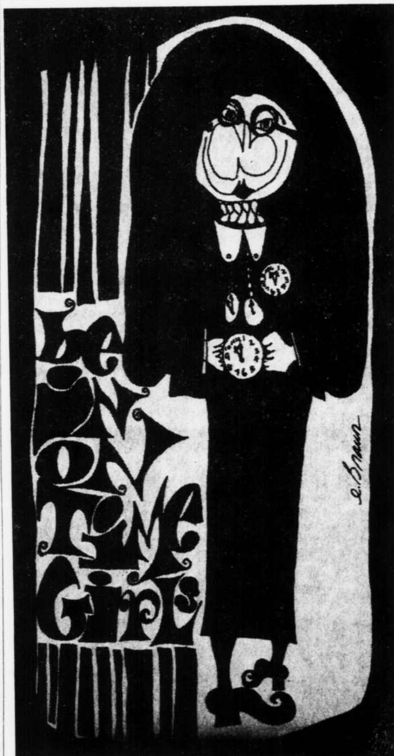
Dean Hampton extends curfew hours.