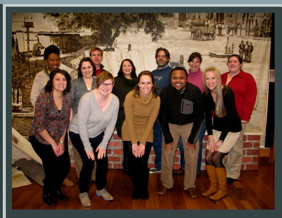
Our Graduate Research Assistants for Spring 2014!

Our graduate students are key to our ability to partner with communities around the region. They are also excellent scholars.