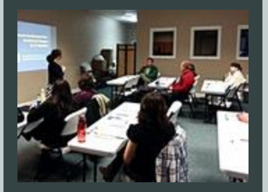
Elementary school teachers discuss Common Core Standards

The expansion of the existing Longstreet Headquarters exhibition--the Heritage Area curated & installed the first displays in 2011--moves the story to the 2nd floor of the dwelling, interpreting a period bedroom & adding panels about other key Civil War properties in the vicinity of Russellville.