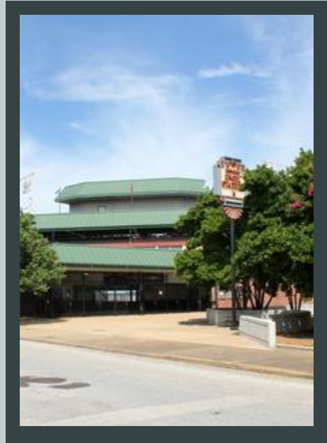
The entrance to Engel Stadium in Chattanooga, TN

To follow our escapades, like us on <a>Facebook</a>!