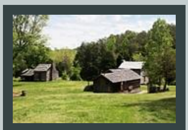
There are now close to 1700 Tennessee Century Farms!

See an update you want to share? Forward our newsletter to your friends!