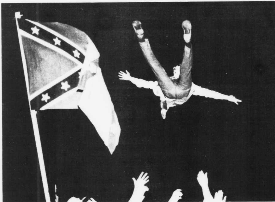
Rebel flags, the sound of 'Dixie,' a student tossed into the air—all exhibited at the "Pep Rally" last week before the Austin Peay game.

Tickets may also be secured by calling committee headquarters at 893-1300 or by going by the local headquarters on the square.