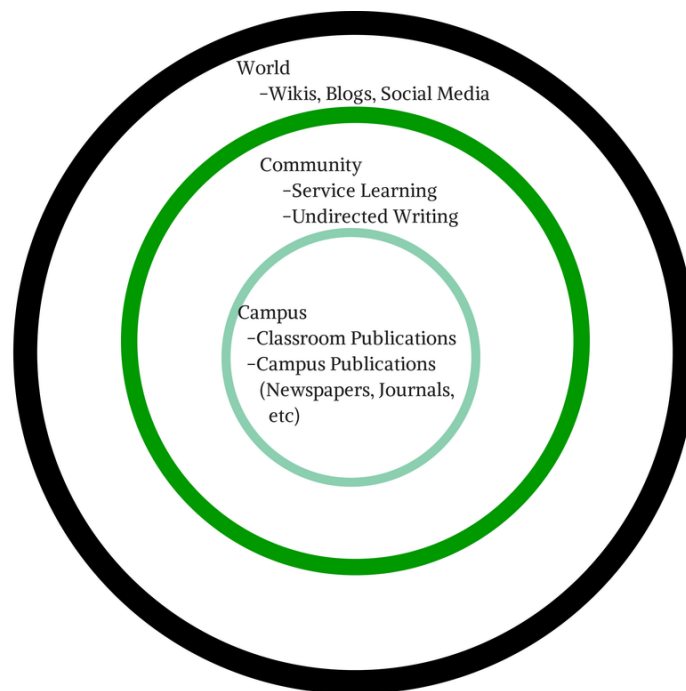
Fig. 1. Realms of Publication.

our surrounding communities, and finally extending to fruitful realms world-wide. In doing so, my goal is to highlight benefits specific to each realm, possible drawbacks, and ways that instructors may maximize the varying means of making writing public offered through these spheres. Teachers who make writing public gain the opportunity to acquaint students with a variety of audiences, contexts, and purposes they may adjust to rhetorically, allowing instructors to highlight varying rhetorical situations and help students, as stated in Chapter 2, to internalize methods of adaptation to situations they will confront in the future.