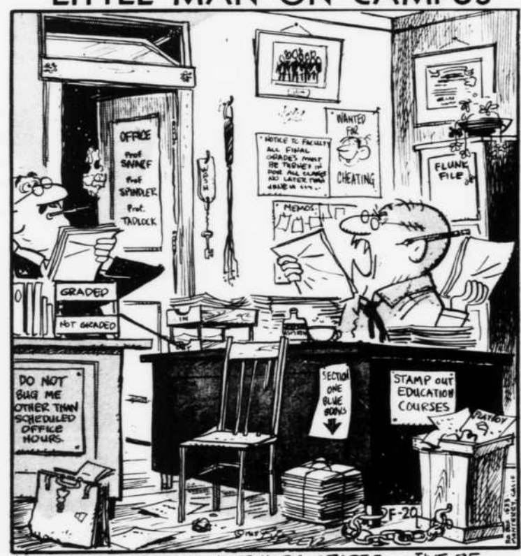
I'VE GONE OVER HIS HOMEWORK GRADES - I'VE RE-CHECKED HIS LAB WORK - FIGURED HIS DAILY AND MID-TERM EXAM SCORES AGAIN, AND I STILL CAN'T COME UP WITH A POINT TOTAL LOW ENOUGH TO FLUNK HIM."