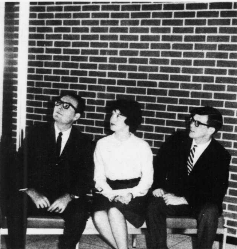
EYES UPWARD—ASB officers view the upcoming year with upturned looks.

PLACEMENT REGISTRATION Seniors and graduate students should register with the Placement Office as soon as possible in order to participate in the campus interviews scheduled to begin in October. Registration forms are available in Room 210, Administration Building.