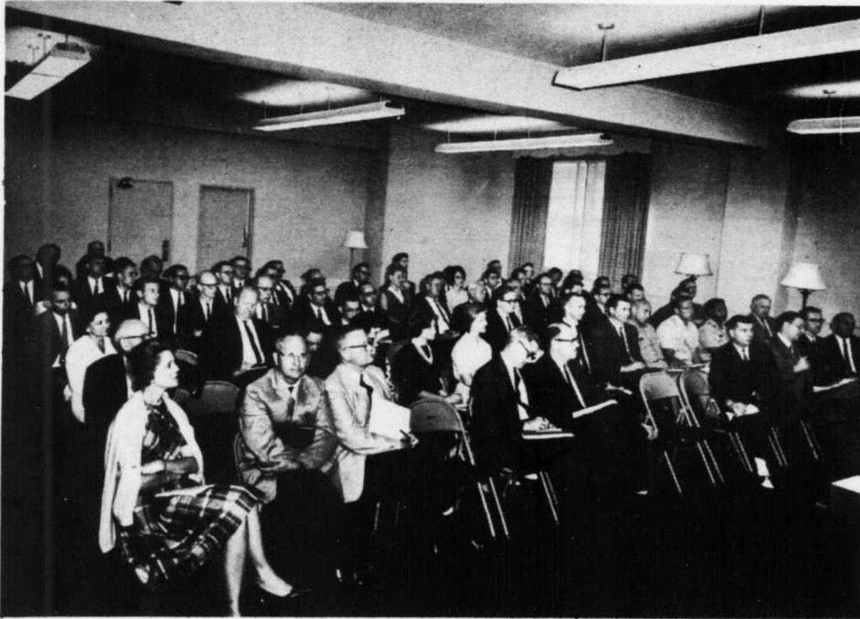
SHOWN ABOVE are sixty-five new faces who have joined the MTSU faculty this fall as they met recently for orientation lectures by administrative staff members. On the first and second rows there are some more familiar (but not old!) faces of the MTSU administrative staff.