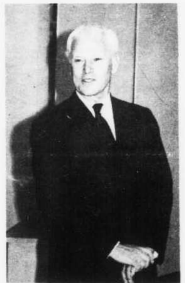
SEN. ALBERT GORE