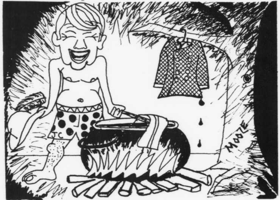
'Ahza dyed in the wool nash'nul Democrat!'

The real losers were Carter's numerous opponents, who were