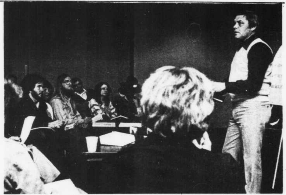
Tom T. Hall

"Tell a story, express your feelings, be a musical Mary Hartman," he grinned. "That's what songwriting is all about."