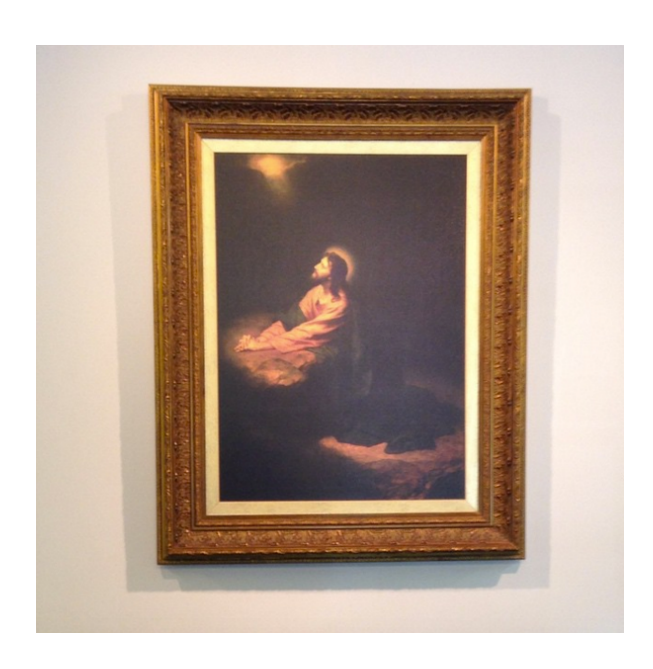
Figure 4: Artwork displayed at one of the entrances in the Nashville meetinghouse

is red brick with a white steeple, ample parking, and immaculate landscaping; the interior contains neutral carpet running throughout the building, plush pews in the chapel, and a plethora of artwork depicting scenes from the Bible. However, there are subtle differences from what one might expect at a Protestant church in Tennessee's capital city. For example, a painting of Jesus surrounded by Native Americans is prominently displayed in the hallway; the chapel sits in the center of the meetinghouse with a hallway and classrooms surrounding it; and there is a distinct and noticeable lack of crosses or crucifixes. A plaque reading "THE CHURCH OF JESUS CHRIST OF LATTER-DAY SAINTS" marks the building.