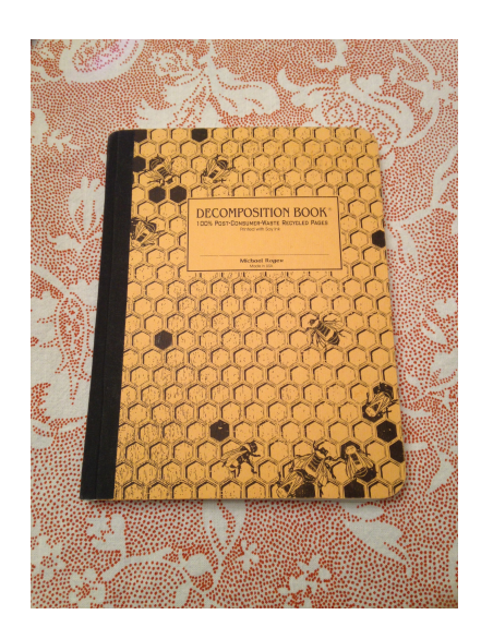
Figure 7: An artifact from the field

Throughout my field journal (a composition notebook featuring a honeycomb design in honor of my interlocutors; see Figure 7), there are occasional series of four or five exclamation points (i.e., !!!!). At first, these clusters of punctuation may appear random, perhaps only the eagerness of a (very) junior researcher. However, upon closer examination, the exclamation points only appear after notes involving one thing: members of the congregation crying .