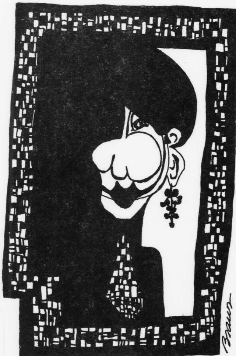
"How else do you think I would dress for the ROTC Brawl?"