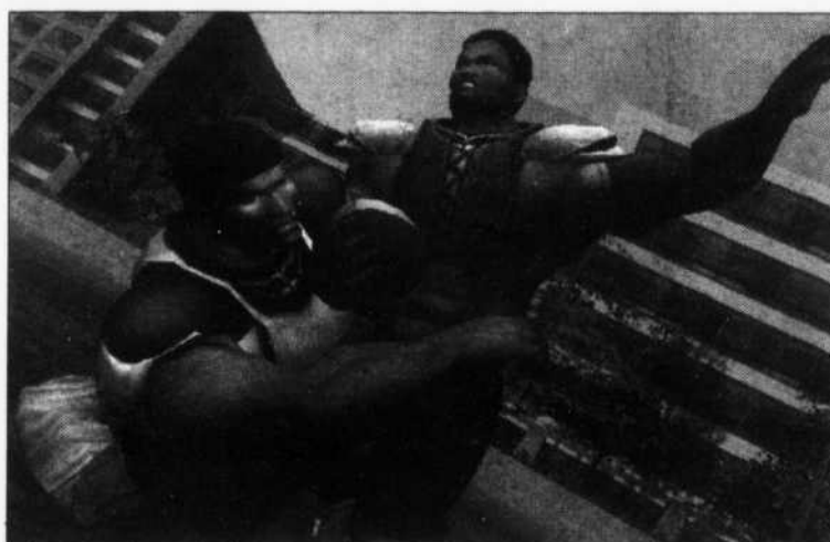
Electronic Arts' latest release, NFL Street , puts a new spin on the gaming world's tired sports genre.

Winning teams are decided by reaching a chosen set number of points. The points are scored by tradi-