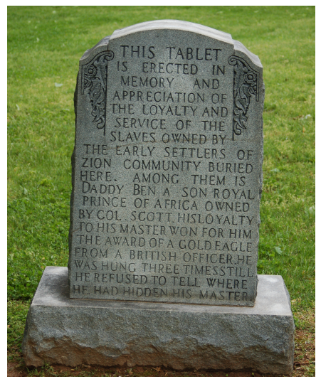
Figure 4 (left): Zion Slave Memorial. Figure 5 (right): Daddy Ben Memorial. Both of these memorials are located as Zion Presbyterian Church in Columbia, Tennessee.