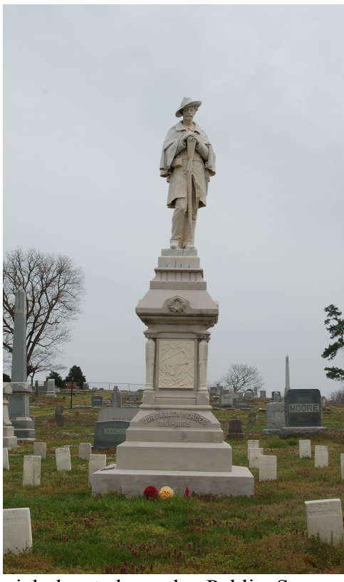
Figure 2 (right): Mt. Pleasant Confederate Memorial, located on the Public Square. Figure 3 (left): Rose Hill Confederate Memorial, located in the Confederate section of Rose Hill Cemetery in Columbia, Tennessee.

African Americans are poorly documented on the landscape. Three monuments and one historic marker specifically recognize enslaved people. Two are located on the grounds of Zion Presbyterian Church, a white church founded in 1809, to recognize the contributions of enslaved labor to the development of the Zion community. One monument, erected in 1999, marks a small area in front of Zion Christian Academy where enslaved people are buried. It honors the "named and unnamed" whose labor was so vital to the community. It does not use the term "slave" or "enslaved," but other sources such as the church's own history and the African American Heritage Tour Guide