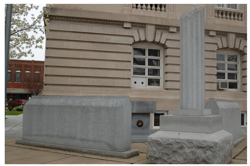
Figure 1: The Wall of Honor. This memorial is sited prominently, in front of the Maury County Courthouse, the center of political power in Maury County. Highlighted here is the Civil War panel that features the names of Confederate Soldiers.

Maury County, Tennessee, established in 1807, is located about an hour south of Nashville, Tennessee, and is easily accessed by I-65. In 2013, the United States Census Bureau estimated Maury County's population at 83,761 people. Of that number, about 85% of the population was white, and 12% black.<sup>2</sup> Political power is located in the county seat of Columbia. Other cities in Maury County include Spring Hill on the northern border with Williamson County, and Mt Pleasant to the southwest of Columbia. Numerous small towns and unincorporated communities are scattered throughout the county.