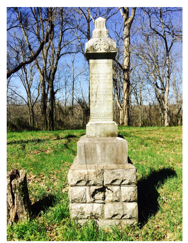
Figure 6: Frierson Slave Cemetery Memorial, Columbia, Tennessee.

Currently, twenty-seven historical markers have been placed around Maury