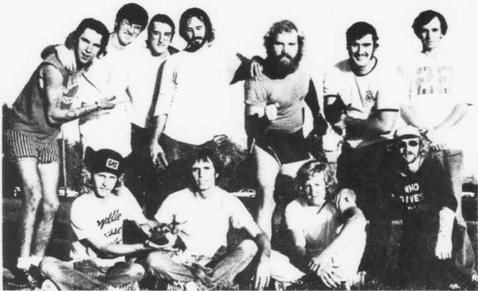
The G. A.'s were runners-up in the men's intramural softball tournament.