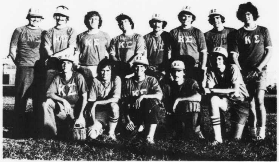
The Kappa Sigma softball team won the men's division of the Intramural Softball Championships.

It was the third straight softball crown the Athletic Supporters have won.