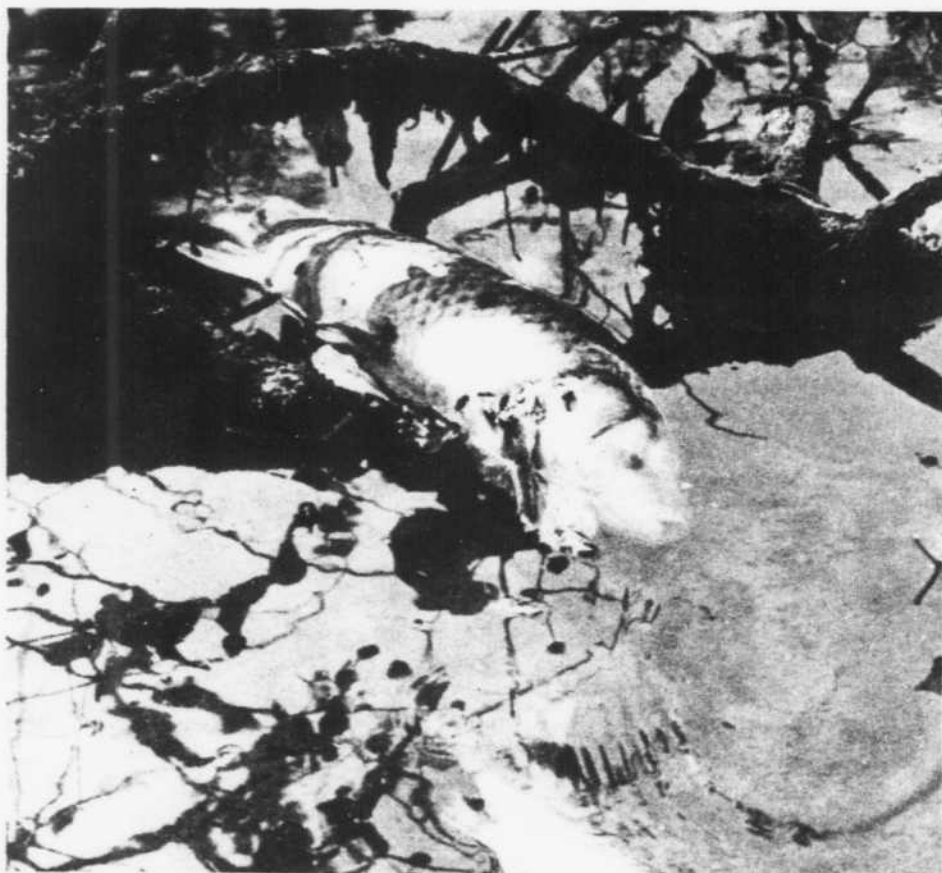
THESE FISH were among those found dead Tuesday near the bridge on Thompson Lane in the west fork of Stones River.