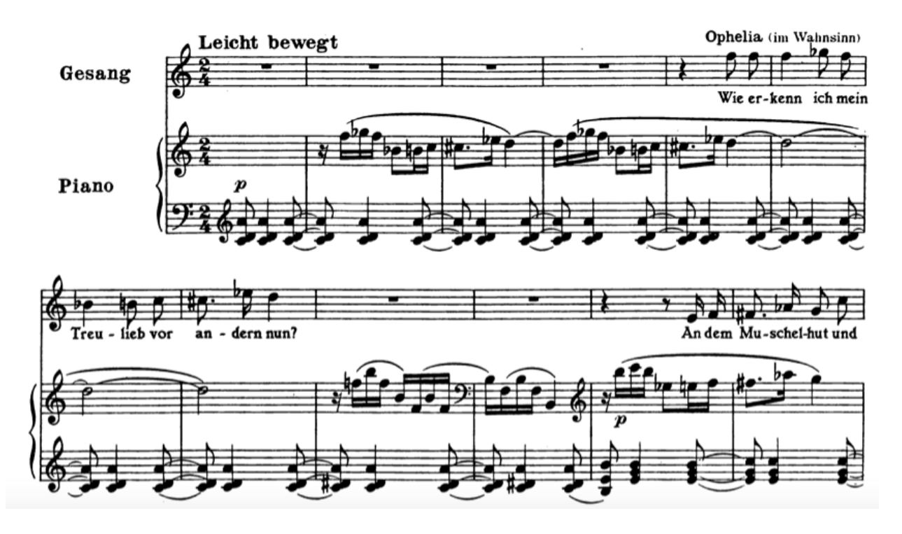
Figure 6. Opening Phrase of "Wie erkenn ich mein Treulieb vor andern nun" 51

An exception to this rule occurs in m. 11, when Ophelia's melodic idea emerges from the sixteenth note motive in the piano on the line "An dem Muschelhut und Stab." This motion condenses the motivation behind the first line in the vocal part, which rhythmically augments the same sixteenth note motive. Even more striking is the declarative "tot und hin, Fräulein!" where the vocal part draws from the inner voices of the accompaniment, a unification of the two voices. From that point forward, the two voices move independently of one another, and the piano part does not deviate from the patterns established at the beginning until the end of the vocal line. Its staggered chordal