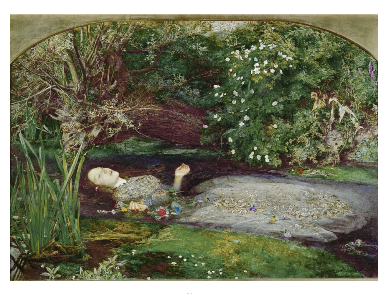
Figure 5. John Everett Millais, Ophelia <sup>35</sup>