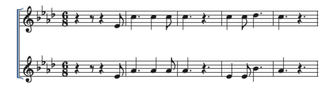
Figure 2. "Gertrude" Motive

The work is defined by three distinctive motives, one of which is thematically less important due to its emerging out of the initial verse. While the strings bubble in a tremolo reminiscent of flowing water, the first motive (Figure 2) occurs in the anacrusis to m. 3. Recitative-like, the vocal line hovers around the major third of the tonic and mediant. This stasis signifies Gertrude's stability, and likely the absence of her action, a reference to one of the key questions that Hamlet raises.<sup>29</sup> Each verse of the lyrical content begins with the same motive, a clear demarcation of thematic material.