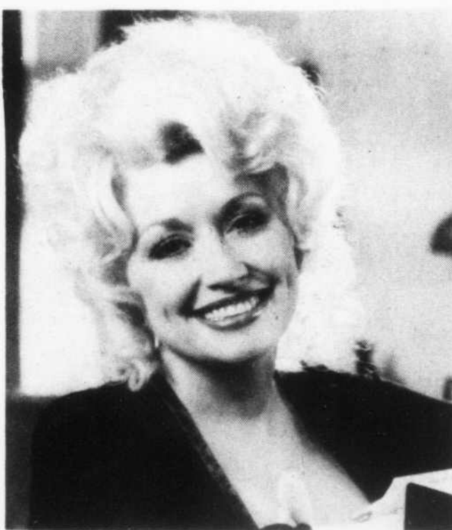
Miss Mona's (Dolly Parton) relationship with Sheriff Ed Earl (Burt Reynolds) opens up a whore-net's of problems.

"I think there's a lot of business things we can do down