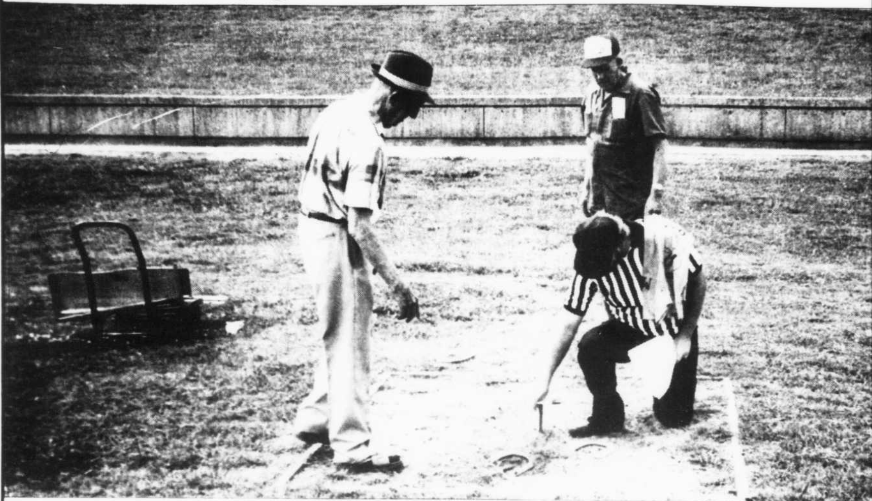
The 1987 Senior Olympics was held at Murphy Center on Wednesday, May 20. Participants competed in golf, tennis and even a one-mile run. These men are competing in the horseshoe event.