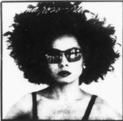
Red Hot Rhythm & Blues Diana Ross (RCA) Best Track: Summertime

This song seems to point out another uncertainty, that of being alone and older. You might have to listen to the words a few times to pick out the theme, but I think it's there: "Summertime when will you come?/I want to put my light things on/I want to put my winter life away/Summertime, I need a sunny day."