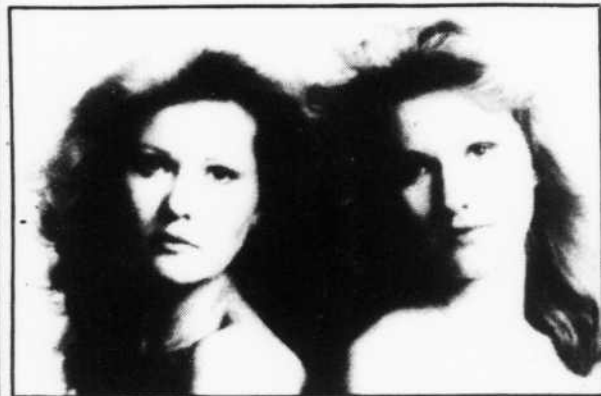
June 5th & 6th HOT TOMATA